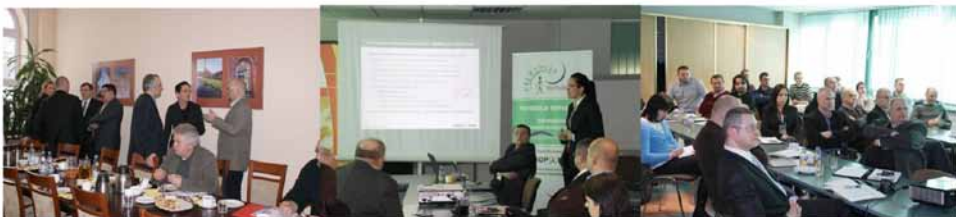
Photograph 1. Meetings with representatives of subcontractors of Gaz-System S.A.

Meetings under the general title „Safety and hygiene of work and managing environment in cooperation with subcontractors carrying out dangerous work involving gas“ were held in the branches of the company in Poznań, Tarnów and Warsaw. In total, 20 subcontractors (about 70 people) of GAZ-SYSTEM S.A. participated in these meetings. The idea behind each of these meetings was open communication by the company in the area of work safety, clear presentation of requirements and encouraging subcontractors to discuss these requirements. In each of the branches organizational solutions from the area of health and safety and environmental management, which are binding for subcontractors, as well as aspects of health and safety and the protection of environment during works on the gas distribution network of GAZ-SYSTEM S.A. were discussed. Representatives of subcontractors expressed their reservations and doubts concerning the requirements from the area of health and safety and environment protection imposed on them. Most doubts were clarified right away. Subcontractors also received details concerning the possibilities of getting support from GAZ-SYSTEM S.A. in association with the work carried out by them.