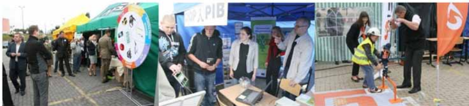
Photograph 3. Educational fair „Accident prevention - culture of safety”.

Moreover, at the fair it was possible to look at means of individual protection, test your knowledge in contests and learn about examples of good practices in health and safety in the area of accident prevention presented in the lecturing tent by, among others, representatives of the Office of Technical Inspection from Olsztyn, Grupa Żywiec S.A. brewery in Elbląg, Gaz-System S.A, Michelin Polska S.A. or Olsztyńskie Kopalnie Surowców Mineralnych Sp. z o.o.