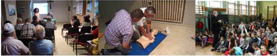
Photograph 2. Activities conducted by „Partnership for accident prevention“.

Another task team was established in Olsztyn; however, in contrast to Ostrołęka, it comprised 45 companies and institutions from the whole country (and not just from a single region). Most of these companies during the year independently implemented chosen points of the „Accident prevention“ campaign taking measures in the area of accident prevention for the benefit of their employees. However, in order to crown the conducted activities they participated in the organization of an educational fair titled „Accident prevention - culture of safety“. The fair took place on September 7, 2012 on the grounds of the University of Warmia and Mazury. The team's work was managed by a group of four partners - institutions working in the area of labour safety (Ogólnopolskie Stowarzyszenie Pracowników Służby BHP Olsztyn division, Central Institute for Labour Protection, District Labour Inspectorate in Olsztyn and the Office of Technical Inspection). About 1000 people took part in the venture.