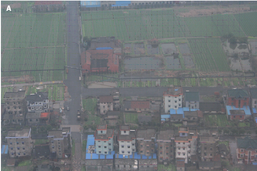
Pictures 2. Unplanned, spontaneous urbanisation of rural areas: farmers are extending their houses to be able to accommodate migrant workers in private rental flats: A) two rural houses can be seen still in their original shape, before densification