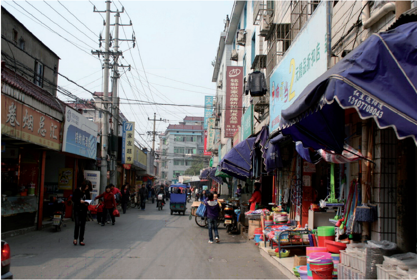
Pictures 3. The traditional Chinese urban structures are threatened to be demolished and replaced by residential skyscrapers (pictures taken in Hangzhou)