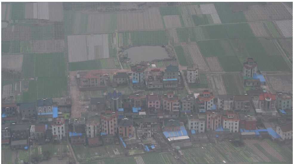
Picture 1. The 'rural' area around Hangzhou city

I took the photo below on 9 March 2010 around noon, just before landing at the airport of Hangzhou. I hardly believed my eyes: why were so many multi-storey houses built in this obviously agricultural area?