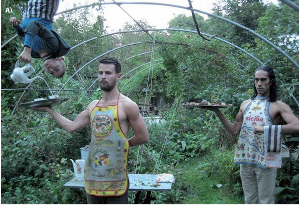
Fig. 4 Artistic inspirations in the city garden spaces: A) Performance, Germany; B) Drawing lesson, Lithuania