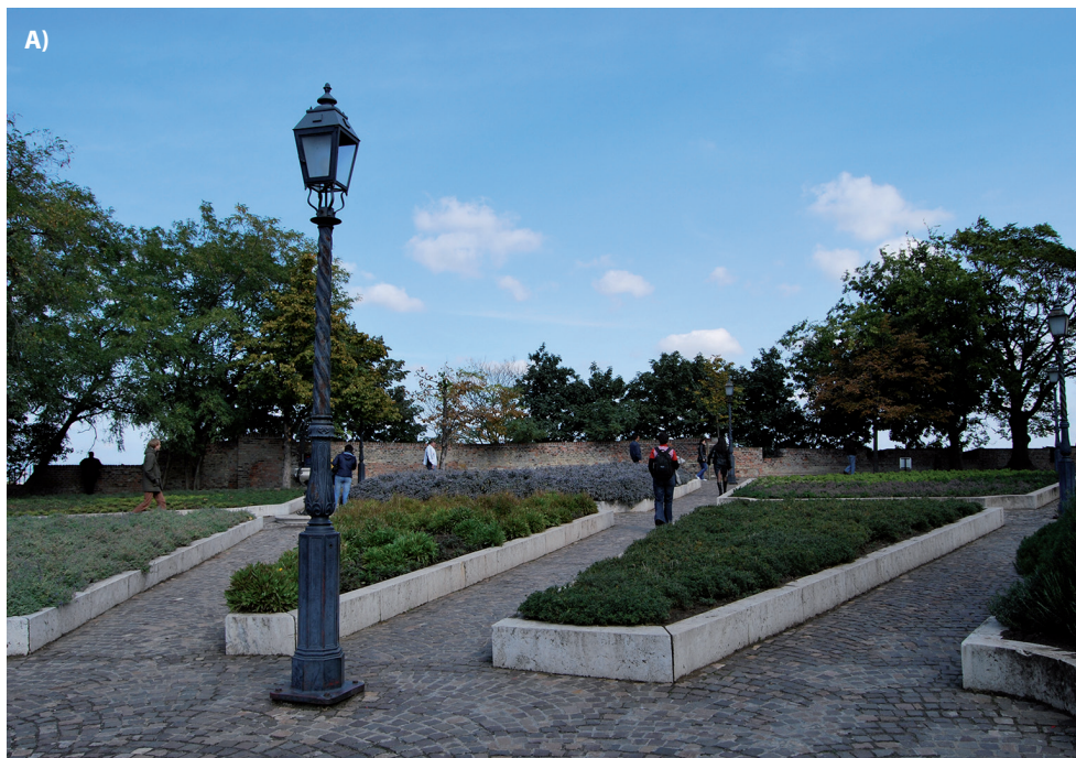
Fig. 1. A) Classical Medieval herb garden in the Old City of Budapest; B) 21 st century vegetable garden in the center of Berlin