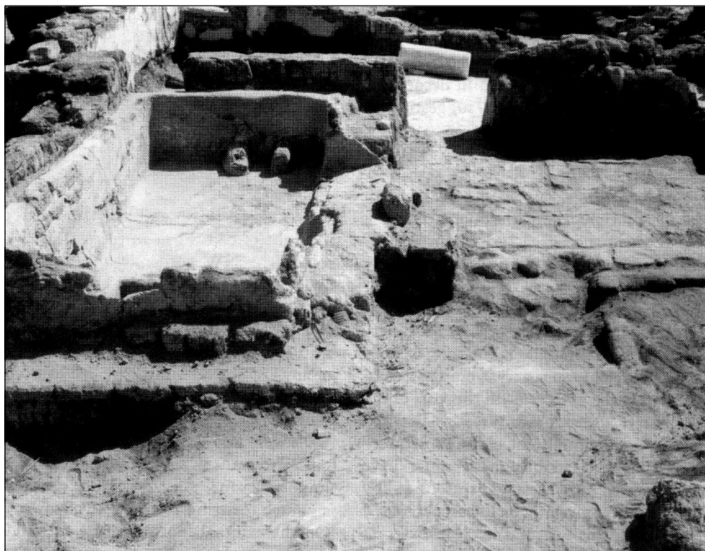
Fig. 2. Site D. Room D.28 with basin, view from the west

From the courtyard D.24 an entrance led to a small room, D.29, measuring 3.55 x 4.26 m. It had a solid wooden door with an inside lock in the form of a wooden beam 186 cm long, sliding into a slot in the eastern wall. A similar blocking of the entrance had been recorded in the southern of the two towers (DB.II). The only furnishing of this wall was a structure by the south wall, distinguished by a large storage vessel