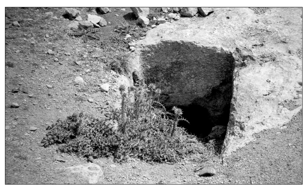
Fig. 2. Khirbet al Berge. View of the entrance to one of the rock-cut tombs of the Roman period