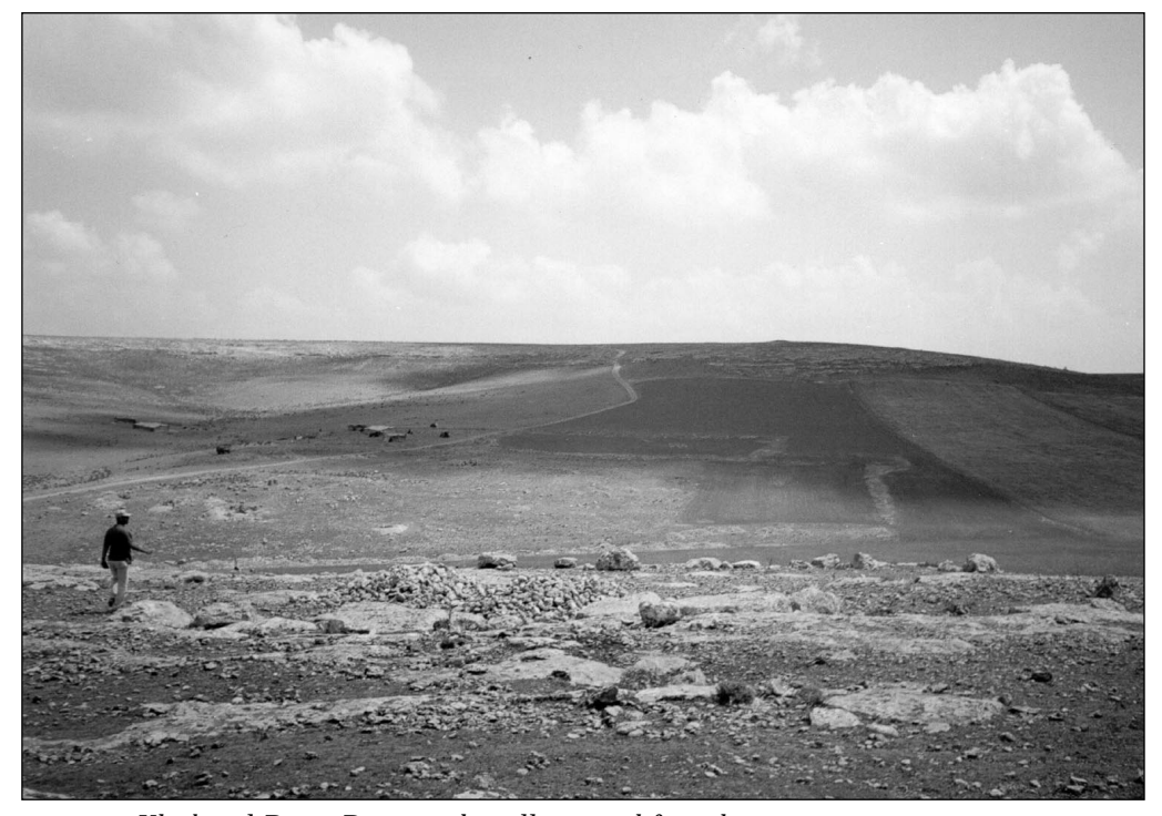
Fig. 1. Khirbet al Berge. Ruins in the valley viewed from the west

Robbers' pits, evidently newly cut, were observed in a number of places inside the buildings, damaging severely ancient occupational layers. (Some of these pits had been covered with stones after our first visit to the site, suggesting that the robbers are continuously active in the area.) The nearby cemetery, obviously connected with the site, also had incurred heavy damage, including apparent removal by bulldozer of layers of soil covering the tomb entrances.