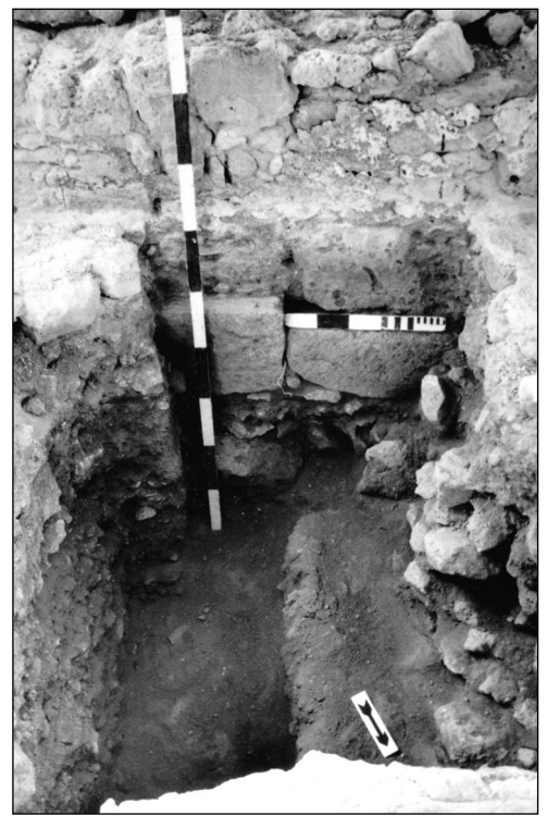
Fig. 2. Villa of Theseus. Pit in the southeastern part of Room 76. View from the north

Excavation continued in the eastern part of the pit along the foundation. The layer of brownish soil and some gravel contained sherds of Attic black-glazed ware, fragments of Color-Coated Ware and, at a depth of about 0.65 m, a Rhodian amphora handle with a stamp bearing the