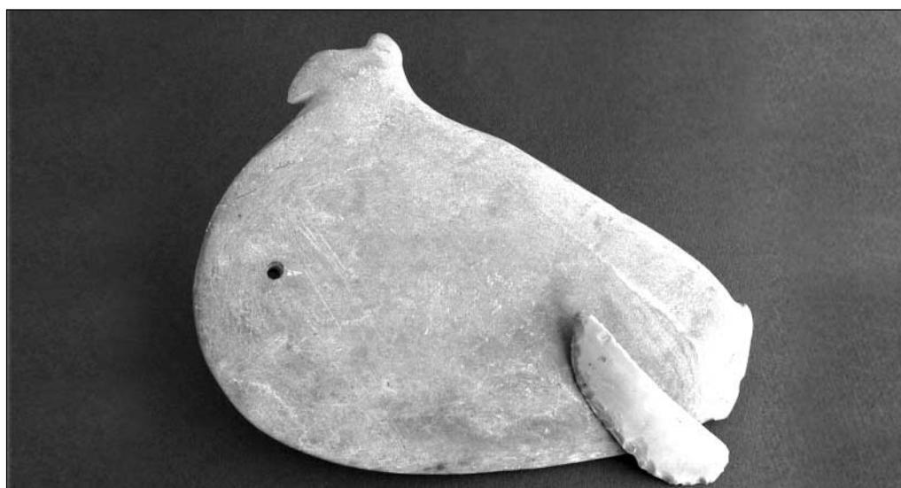
Fig. 2. Western Kom. Greywacke palette and flint knife found inside a storage jar