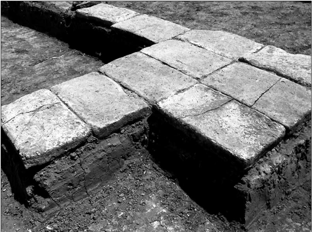
Fig. 8. Eastern Kom. Red-brick tiles in the trench on the eastern slope

For the moment, the interpretation of the architecture on the eastern kom raises some difficulties. The assemblage of finds is not much different from that in other parts of the settlement, but the layout of the buildings (round structures, different orientation) and the construction materials used, such as red-brick not noted elsewhere on the site, make the area quite distinct.