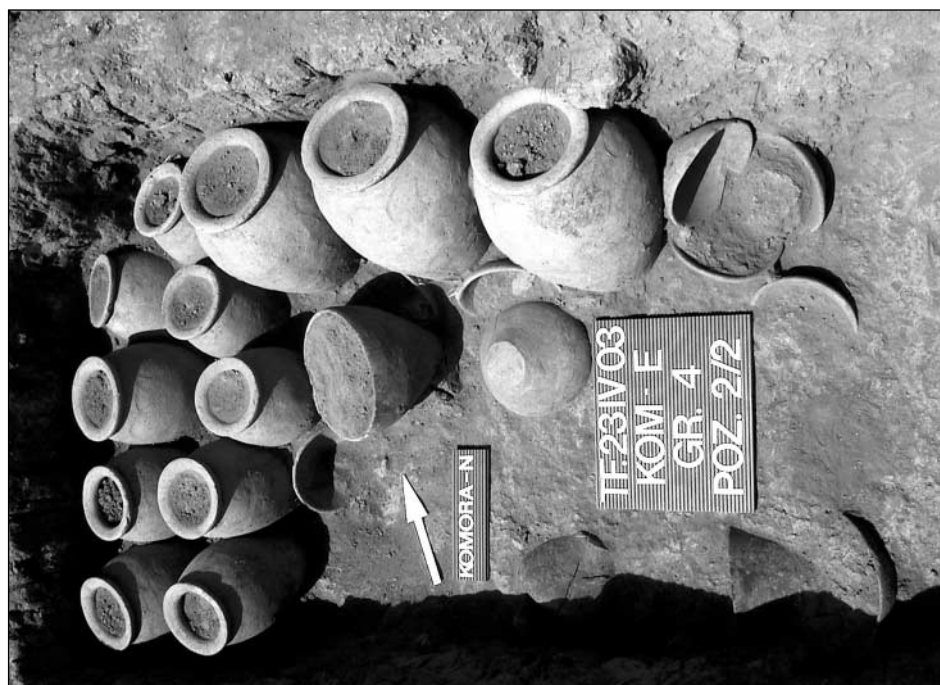
Fig. 6. Eastern Kom, Pottery found in the north chamber of Grave 4