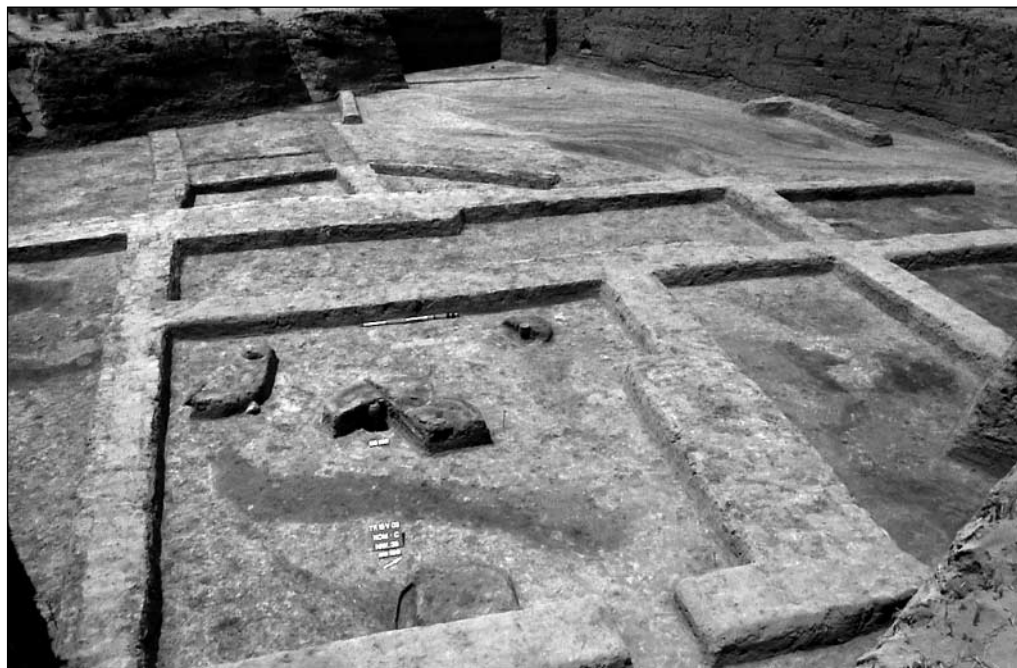
Fig. 5. Central Kom. Mud brick structures