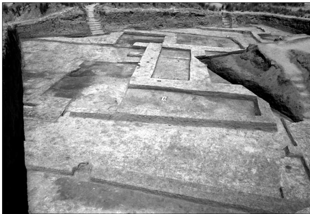
Fig. 1. Western Kom. Nagadian building, older phase