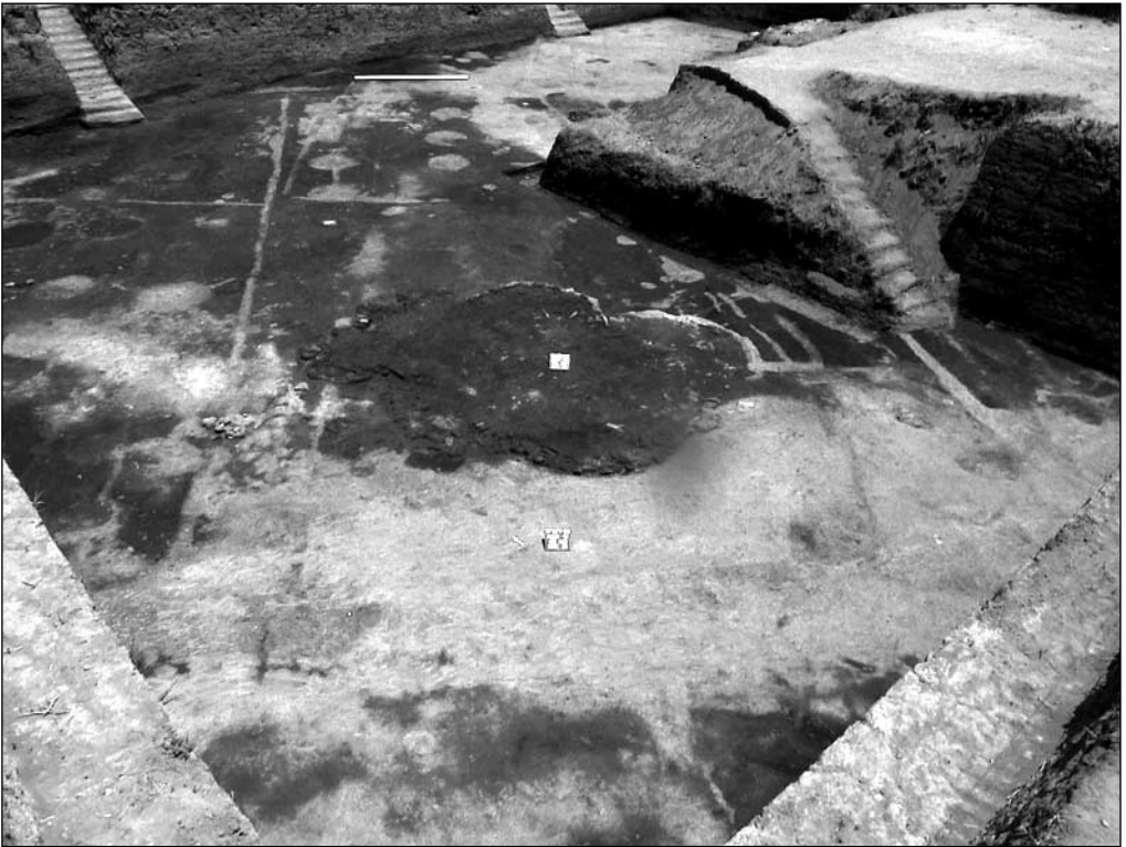
Fig. 3. Western Kom. Remains of brewery and furrows of the Lower Egyptian Building

ed. In the eastern part of the trench, several rooms oriented NE-SW were cleared around two courtyards separated from the rest of the excavated area by a 1.5 m thick wall ( Fig. 5 ). Evidence of soil erosion caused by wind and water was observed in the northwestern section of the trench.