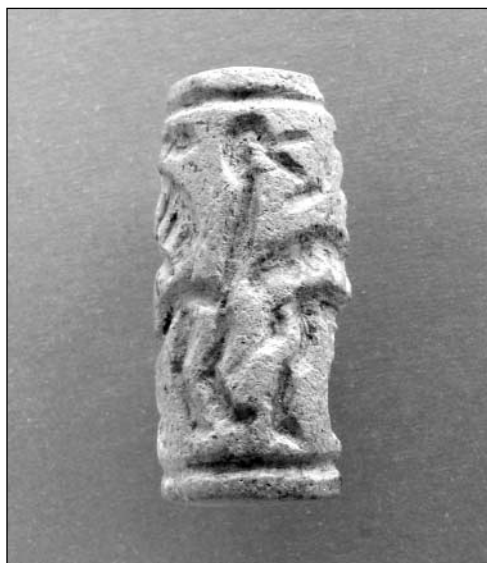
Fig. 4. Central Kom. Cylindrical seal with animal representations

Among the more noteworthy finds was a stone pendant in the shape of a gazelle, a fragment of cylindrical seal with animal representations (Fig. 4), and a number of clay seals.