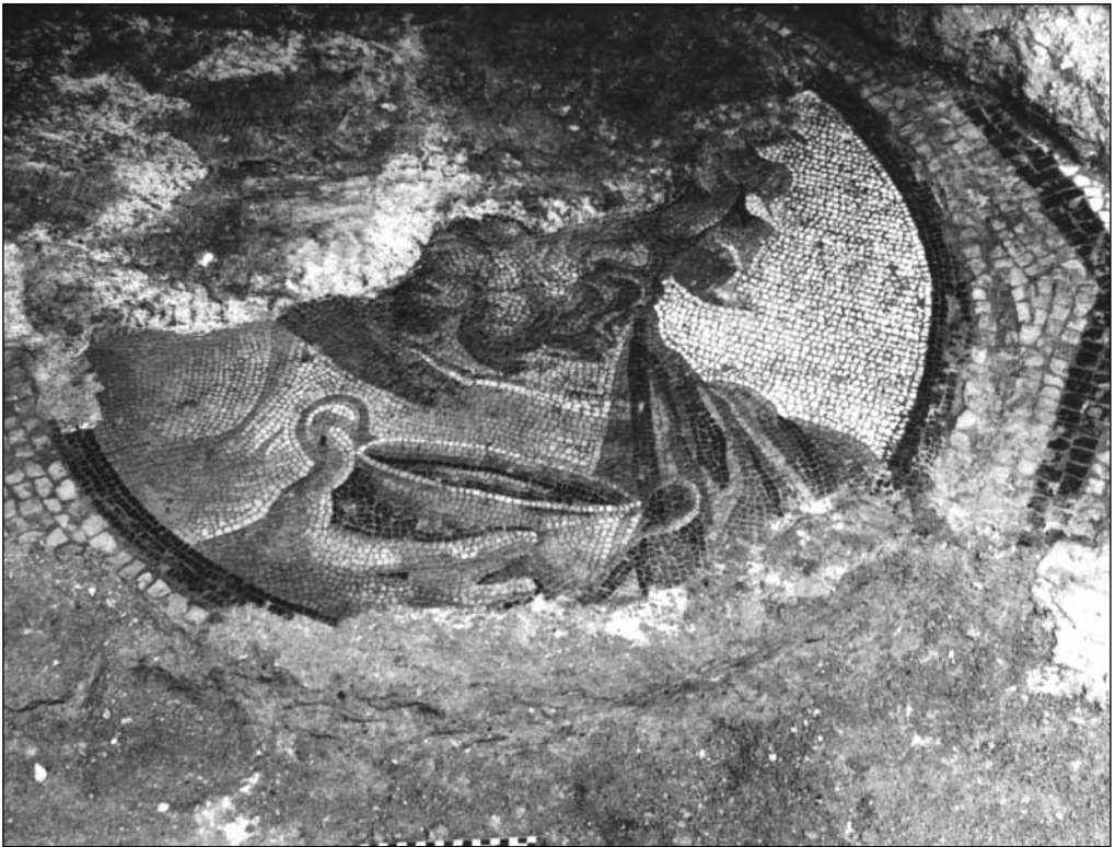
Fig. 7. Figural emblema from the mosaic found below the theatre

Finally, mention should be made of a number of artifacts found in good condition in the fill removed from a subterranean vaulted cellar in the Baths complex, excavated prior to undertaking the planned preservation work. Two glass vessels and two complete lamps were recovered from a thick layer of ashes accumulated under the vaults near the furnaces. 9) All the finds, accompanying pottery were dated to the 5th century AD and should be considered as referring to the second building phase of the Baths.