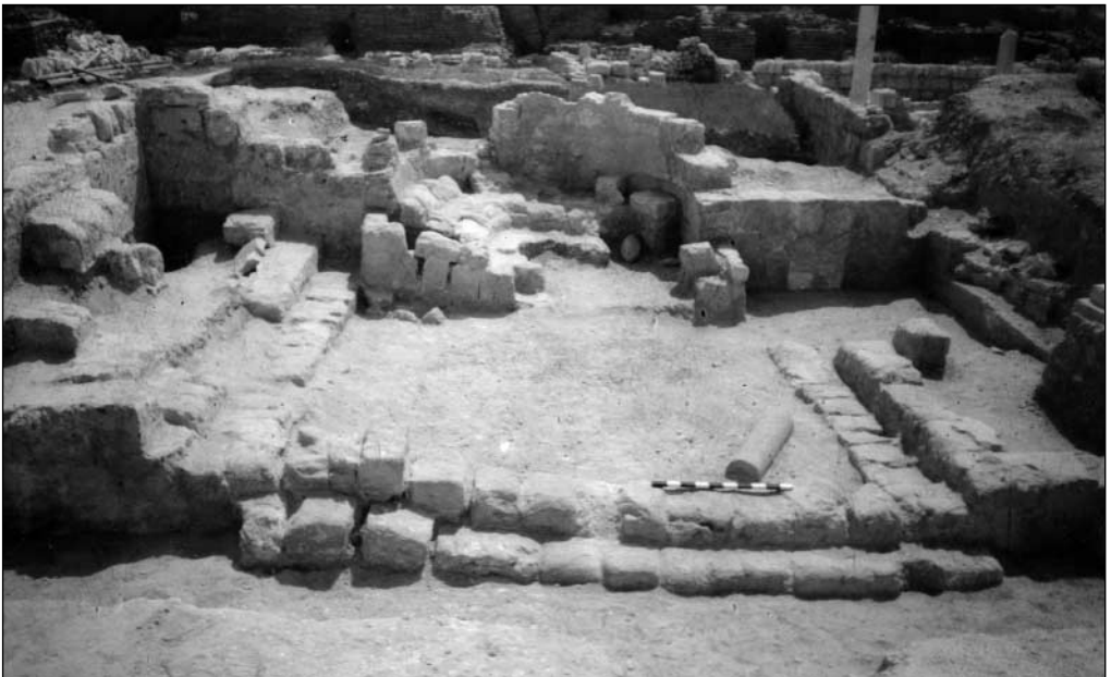
Fig. 6. Late Roman Auditorium P