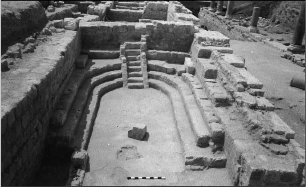
Fig. 5. Late Roman Auditorium K, view from the north