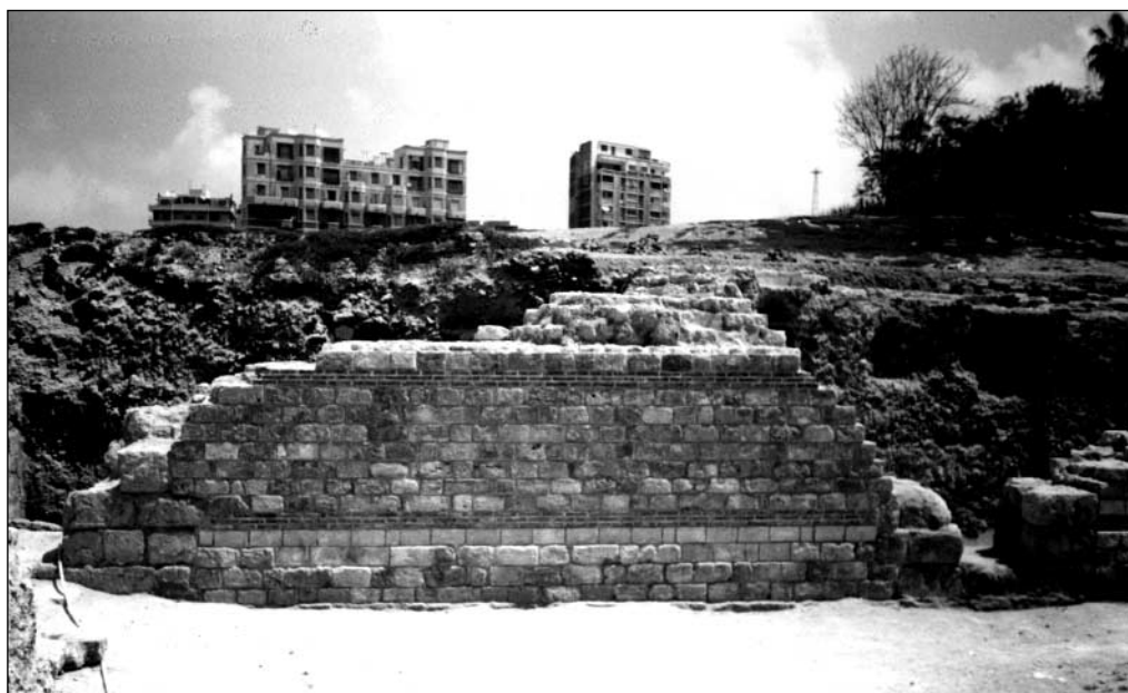
Fig. 9. Theatre Portico. Segment H of the back-wall, after restoration