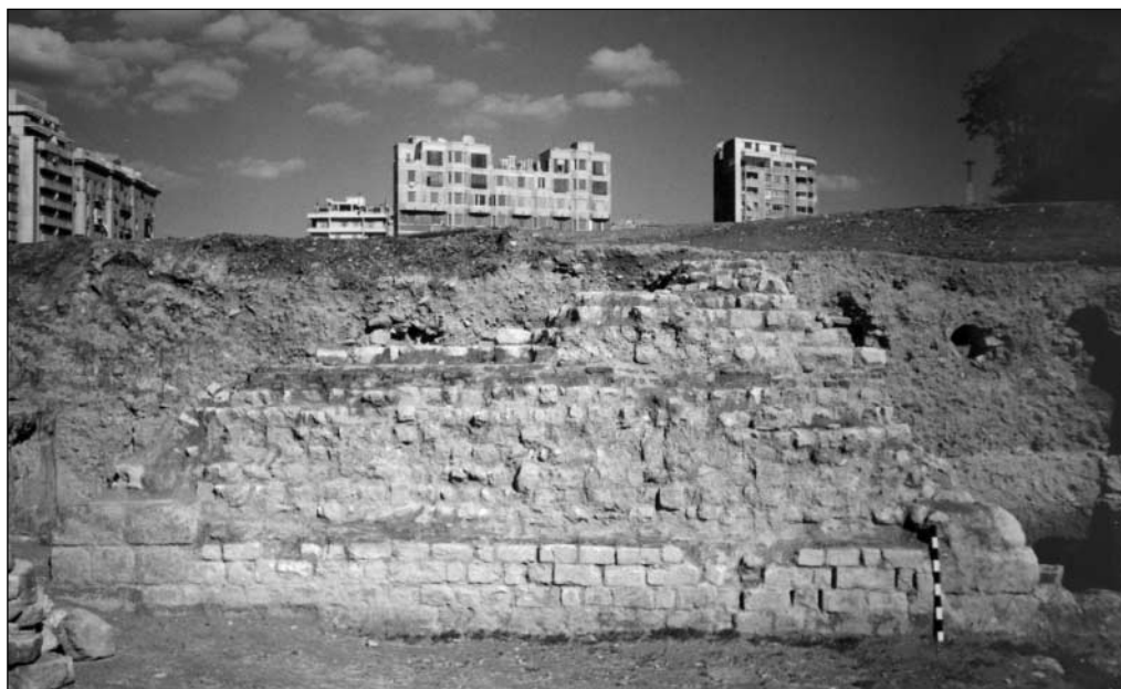
Fig. 8. Theatre Portico. Segment H of the back-wall, before the 2002 restoration