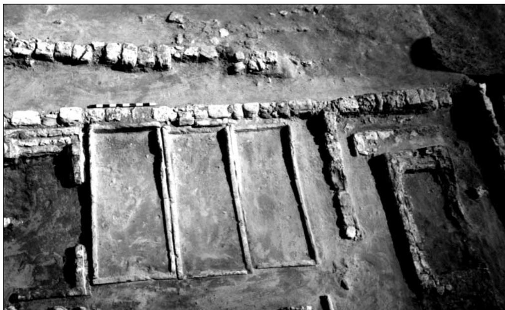
Fig. 1. Area E. Moslem Upper Necropolis, graves E 42-45. View from the west