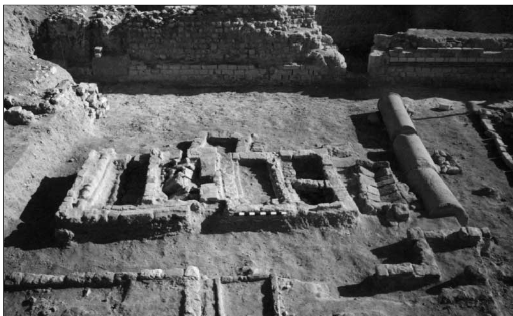
Fig. 2. Area E. Moslem Upper Necropolis, graves E 33-35. View from the west