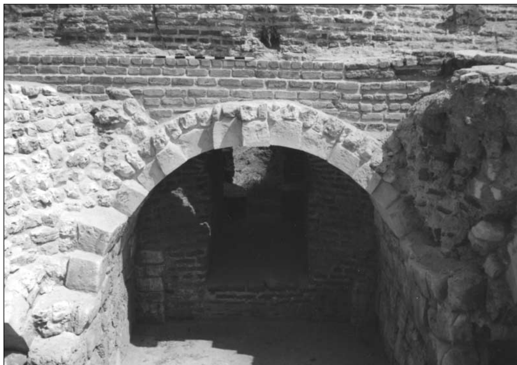
Fig. 10. Roman Baths. Vault of the underground area after restoration

Some supplementary conservation work was also undertaken in the Villa of the Birds which had been restored in 1999. 11) The mosaic with panther ( \alpha -6) had been seriously endangered last year by water seeping from a nearby broken pipeline, causing a most dramatic resurgence of the effects of increased damp. Instead of detaching the mosaic, it was decided to treat it in situ . The efflorescence of water-soluble salts appearing on the surface was carefully removed mechanically and the surface was rinsed with 5% ammonia. To assure unimpeded drainage, piping was introduced into the mosaic substructure, c. 30 cm below