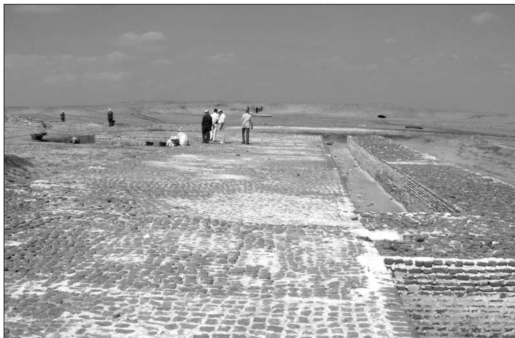
Fig. 1. The stage building, looking west

A commission of the then EAO, headed by Messrs. Kamal Fahmy Ibrahim and Hassan Shehata, decided in May 1993 to proceed with the restoration of the