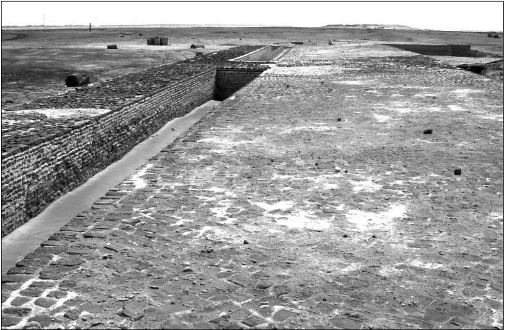
Fig. 2. The stage building, looking east

presents a flat surface restored to a uniform level nearly even with the present ground around it ( Figs. 1, 2 ). About a dozen architectural members of Aswan red granite were reassembled in the middle and protected with sand.