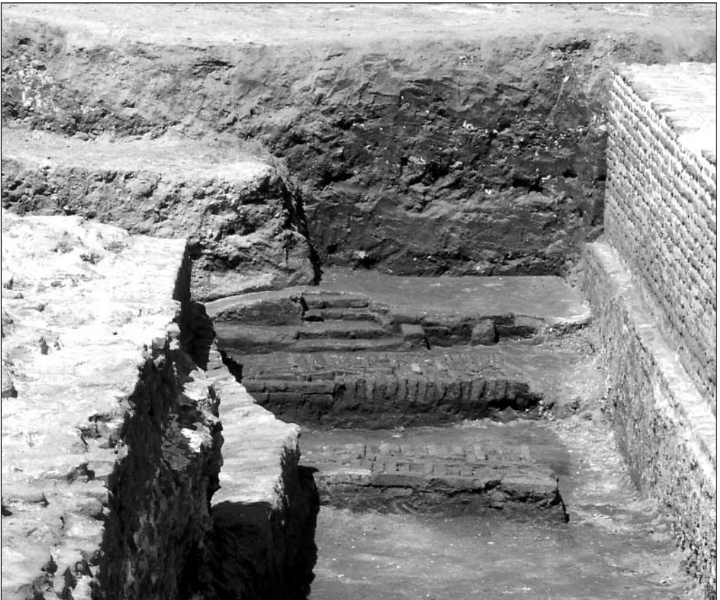
Fig. 3. The western parodos overlying earlier brick structures

It was observed that after the monument had been abandoned, the hollow of the theater was filled progressively with garbage, which now forms a very hard,