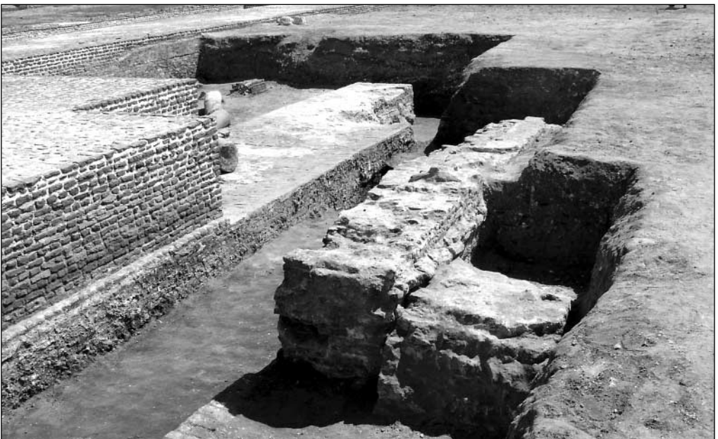
Fig. 5. The pulpitum at the inner end of the western parodos, looking north