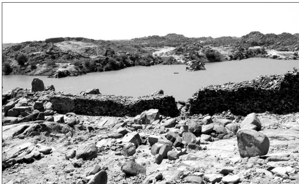
Fig. 2. The fortress at Swneqi