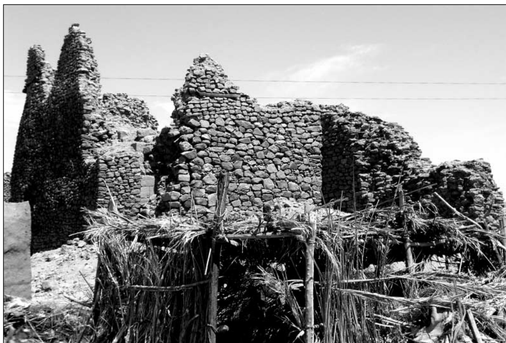
Fig. 3. The architecture in Merawe Sheriq