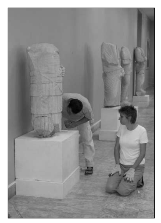
Fig. 2. Restoration work on the archaic statues in the gallery of Allat

Another of the season's tasks was to design a shelter to be erected over the mosaic discovered in 2002-2003.<sup>4</sup> Consultations with colleagues at the DGAM led to the decision to exhibit this nearly complete