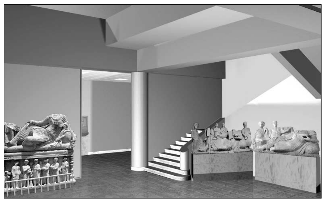
Fig. 3. Refurbished Museum entrance hall. To the right, sarcophagi from the 'Alaine tomb (Rendering D. Tarara)