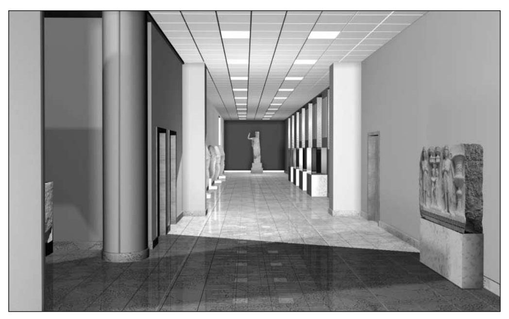
Fig. 4. The gallery of Allat in the new museum (Rendering D. Tarara)