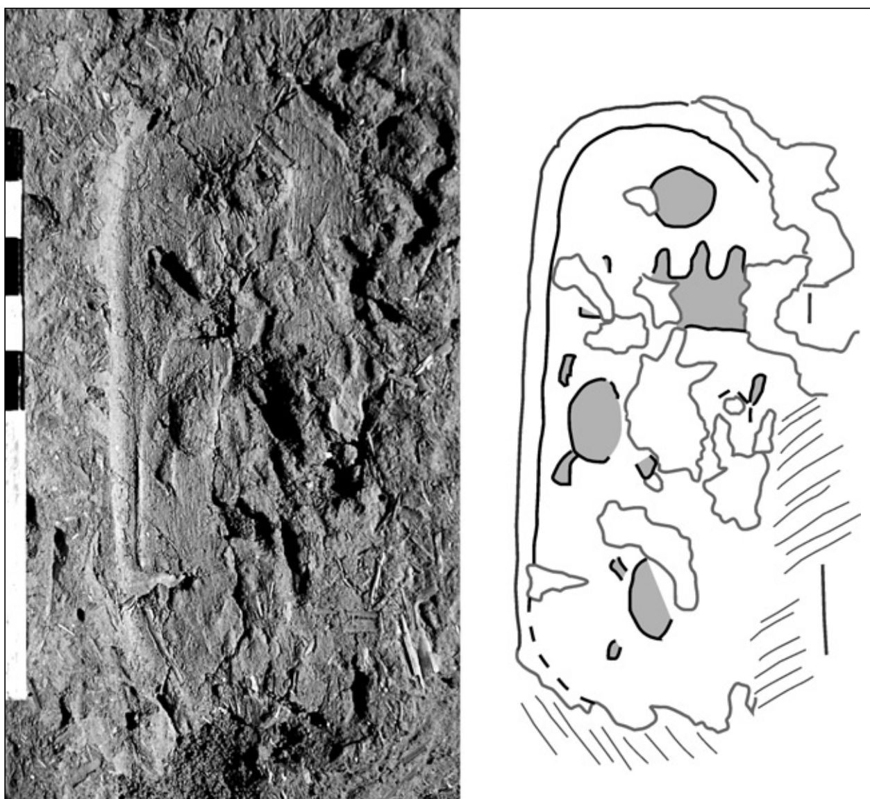
Fig. 4. Stamp on a brick with the name of Tuthmosis IV, Mn-chprw-re (Photo J. Śliwa, drawing E. Szpakowska)

originally measuring c. 40 x 18 x 12 cm. Occasionally, the presence of stamps was only barely signaled. Recorded stamps fall into one of two types: cartouche or rectangular field with inscribed cartouche. Sometimes a double-feather motif was added to the cartouche. The name on the best preserved stamp can be read despite some minor damages as Mn-chprw-re - Tuthmosis IV [Fig. 4]. 3