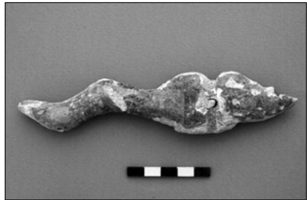
Fig. 2. Fragment of a wooden horn from the crown of Ptah-Sokaris-Osiris

Pharaonic material was found also outside the tomb, mainly as beads, fragments of amulets and ushebti figurines. Among the more important objects of