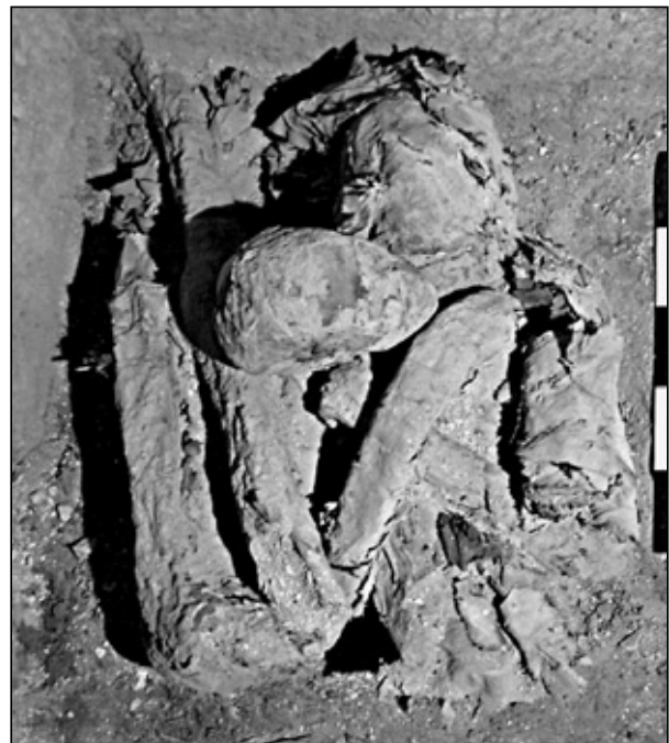
Fig. 3. Damaged mummy discovered during the clearing of the chamber; the head lying on the chest is from another mummy