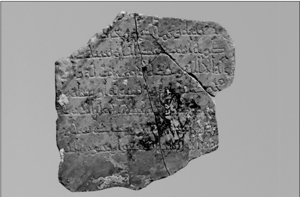
Fig. 4. Stela (reg. no. 5111) giving the deceased woman's date of death as 247 AH/AD 861

Two of the graves from the cluster of graves inside locus (=lecture hall) G were simple pits in the ground without a preserved stone casing (G 301 and G 303), one grave was excavated into a bench of the auditorium (G 305) and five others had been cut into the Late Antique pavement and covered with slabs. Two (G 305 and G 306) were children's graves. Adult burials followed a standard size: 1.60 by 0.88 m, while the children's graves measured 1.30 by 0.45 m each. The condition of bones, both in the grave pits and in the stone tombs, was comparably poor. 7