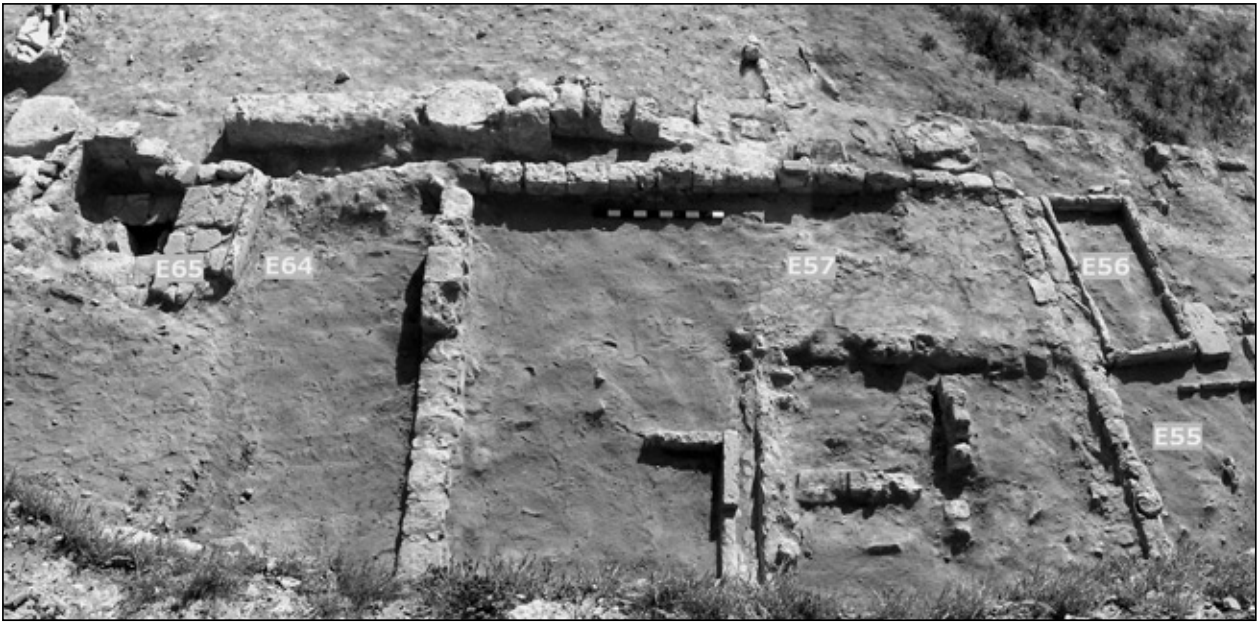
Fig. 1. General view of the tombs from the Upper Necropolis phase of the Islamic cemetery discovered in Sector E