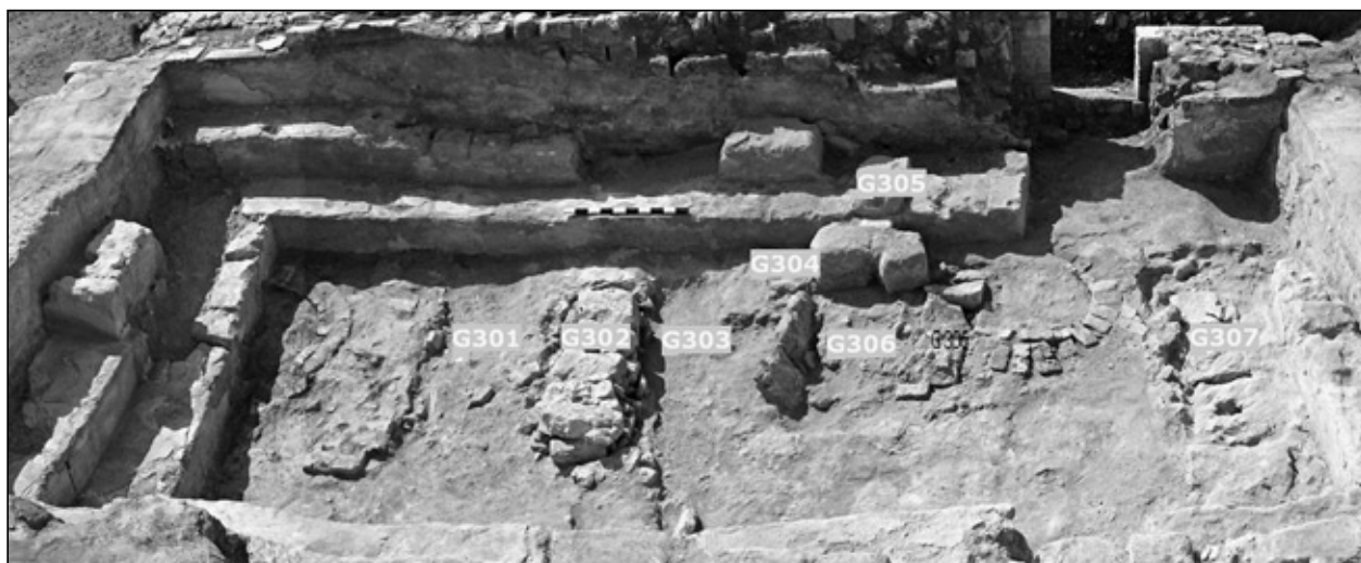
Fig. 3. Graves of the Lower Necropolis discovered inside auditorium G in Sector G

The same division of the Middle Necropolis into two phases of use was observed. 6 Three later graves were recorded