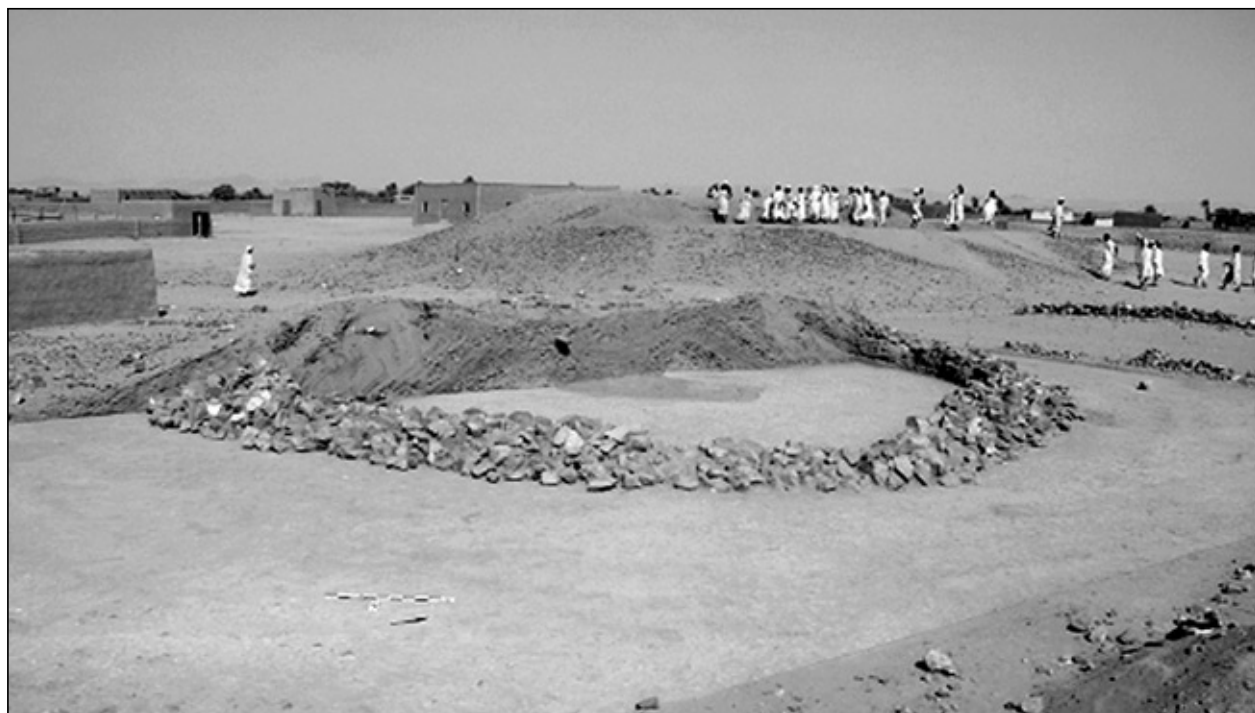
Fig. 1. Hagar el-Beida 1. Excavations of tumuli 1 and 9; the latter, a satellite burial of the "royal" mound, in the foreground

Substructure type II: The most common element of this is a roughly rectangular shaft, cut vertically in alluvial rock and filled with pure sand and gravel. Another highly distinctive feature is the use of massive, flat and oblong stones of local provenience to secure the entrance to the chamber. 7 The chamber itself can be roughly oval (variant A, as in HB1-T6) or L-shaped (HB1-T7, HB1-T9) with an oblong main burial niche and a kind of perpendicular annex.