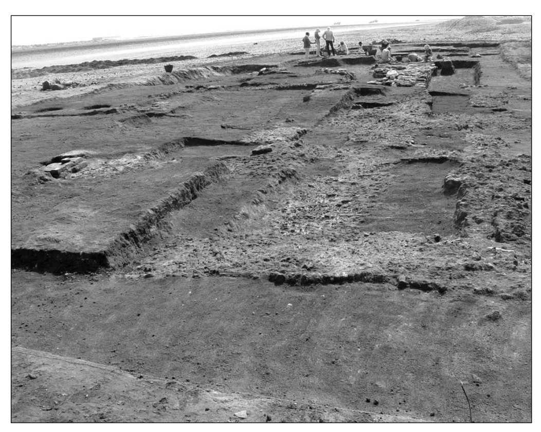
Fig. 2. Plan of the architectural remains uncovered in Sector 2

Extension of the sector to the west was aimed at tracing the architectural plan of the house with the mosaic floor. Unfortunately, the remains proved to be severely damaged by later digging and