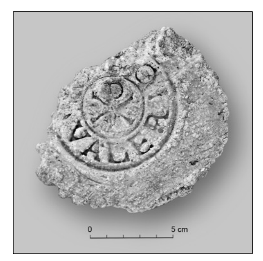
Fig. 4. Amphora stopper of lime mortar

J. Clédat (1913: 79-85) Other relatively rich private residences must have stood here, blending well into the ancient urban layout which can still be occasionally discerned on the ground surface, especially east of the mosaic trench.