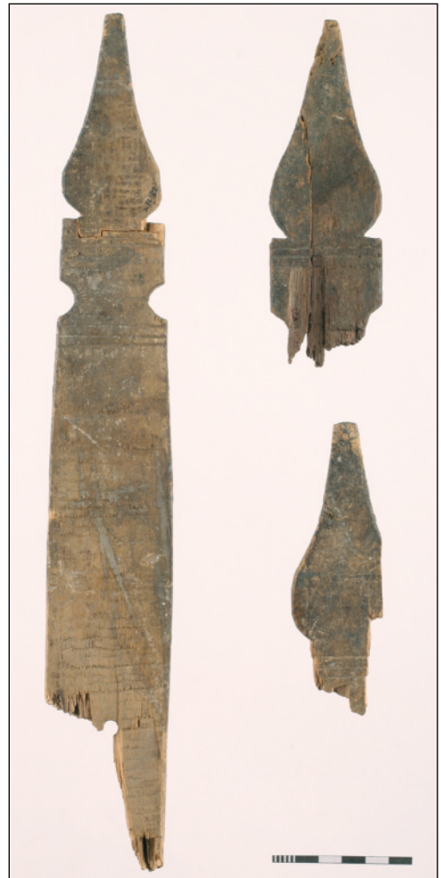
Fig. 5. Leaf-shaped wooden finial

Despite the fact that three fragments of the background have been preserved, the pattern of the decoration is difficult to determine. In different places it is possible to observe sets of two holes each: round for the wooden peg and square for the iron nail. Irregular paint stains (green and red) can also be seen, suggesting that particular