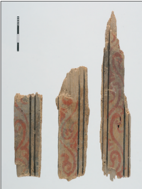
Fig. 4. Slats with painted floral scrolling

Another element of the bigab decoration are the 17 pieces of slats forming the structural frame. Some of these slats have the back cut at right angles, perhaps for the purpose of joining elements. The hexagons and slats feature the same uniform decoration consisting of three grooved lines between painted stripes by the edges. The colors in this case are