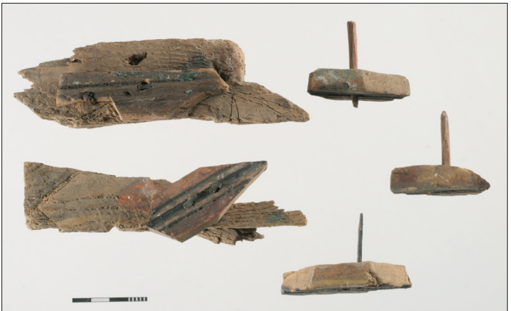
Fig. 3. Examples of mounting of the altar screen elements