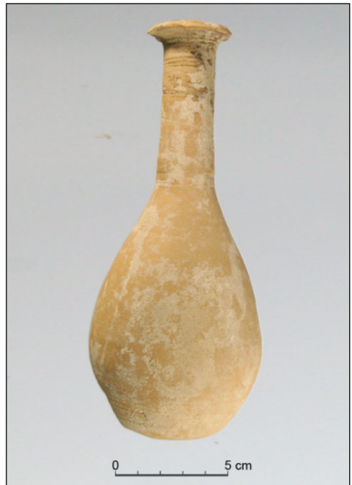
Fig. 5. Unguentarium, 1st century AD