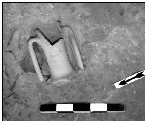
Fig. 1. Neck of pseudo-Kos/Dressel 2-4 amphora in situ, c. 125-150 AD

"Byzantine" wall) is made up of a very compact layer of shattered vessels, large pieces of which can be reconstructed. On the level at which the first sherds of this deposit were recorded (1.85 m), some remains of a human skeleton (a few teeth), victim of a quake, were found. Most of the deposit still needs to be reconstructed and analyzed, but it has already yielded a fragment of an Eastern Sigillata A plate with planta pedis stamp [Fig. 4], possibly of Late Hellenistic date, and a fragment of a big plate of Italian terra sigillata from the early Augustan period. The deposit, however, comprised mostly amphorae with a decidedly small share of tableware.