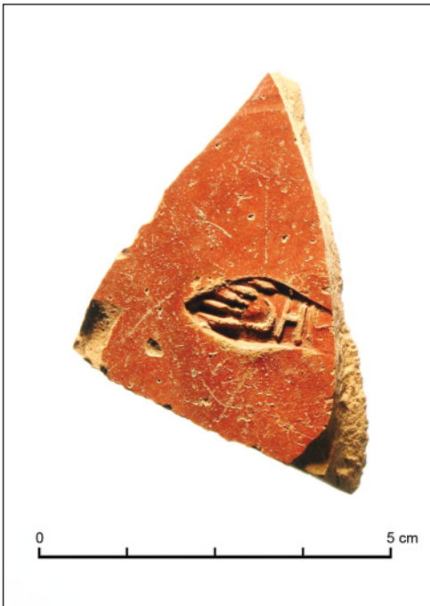
Fig. 4. Fragment of ESA plate with planta pedis stamp, second half of 1st century AD