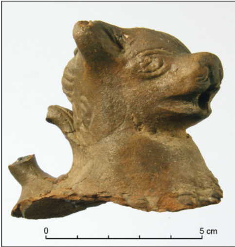
Fig. 2. Zoomorphic vessel FR 18/06