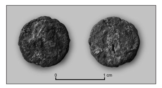
Fig. 1. Bronze coin Nd.07.209

Only the terminal letters of the legend, most probably not divided, can be seen on the obverse. The inscription on the reverse is obscure and partly missing. It could be that we have here a case of imitation of the Concordia Aug type with cross, struck in the reign of Arcadius in a number of imperial mints, either with his name or with that of Honorius or Theodosius II. The coin is very small and light, which could also be construed as proof that it was indeed an