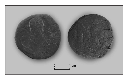
Fig. 4. Bronze coin Nd.04.357