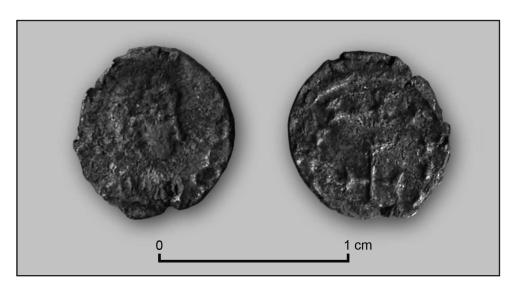
Fig. 2. Bronze coin Nd.07.402

* Research Center for Mediterranean Archaeology (IKSiO from 1 September 2010), Polish Academy of Sciences