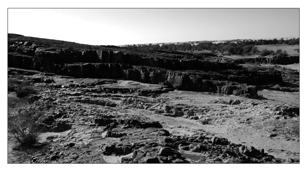
Fig. 3. Rock art "gallery" at the Keheili 5 site