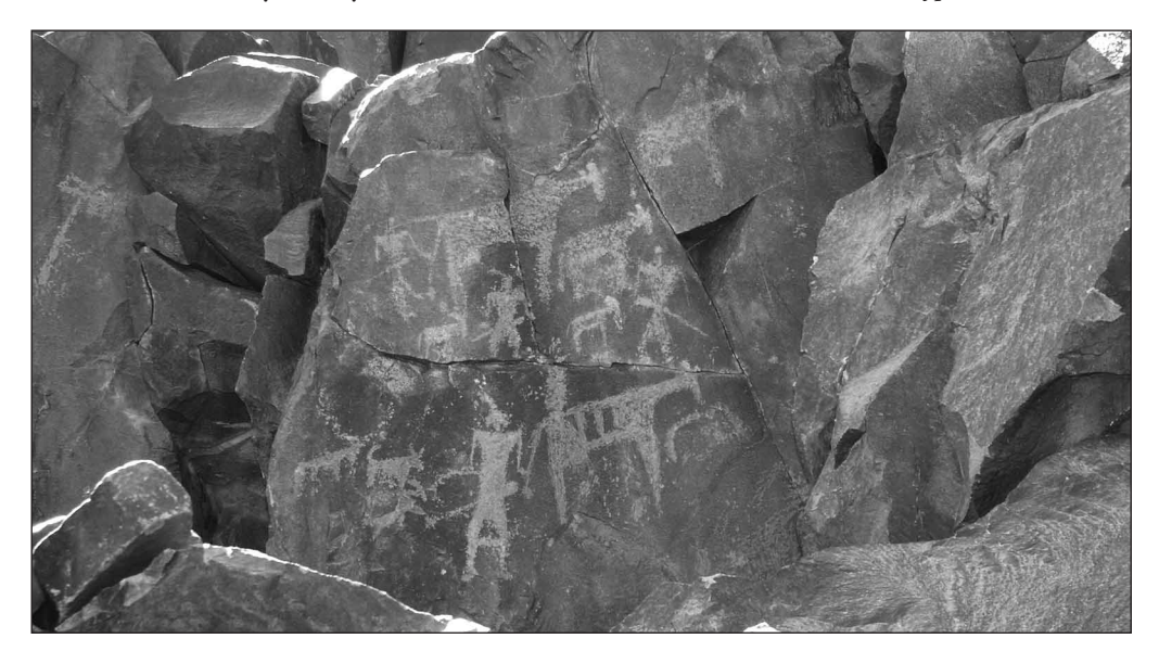
Fig. 2. Rock art panel from the "gallery" at the GM67 site