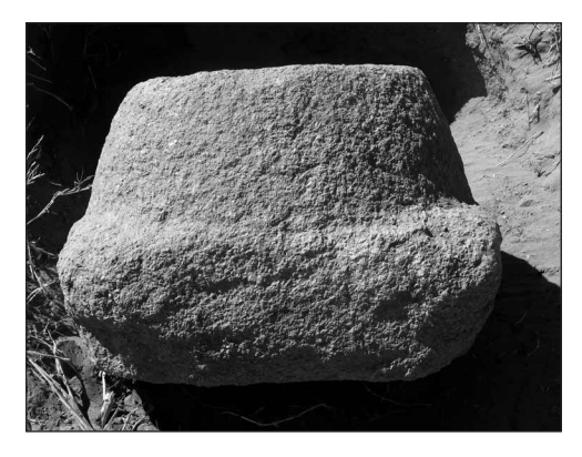
Fig. 1. Sandstone capital from the ruins at site GM52

Two or three late Meroitic/post-Meroitic cemeteries were discovered: GM14 (recorded in February 2007 by ethnographer P. Maliński