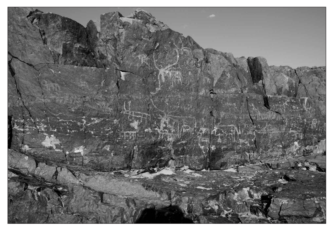
Fig. 4. Close-up of part of the rock art "gallery" at the Keheili 5 site