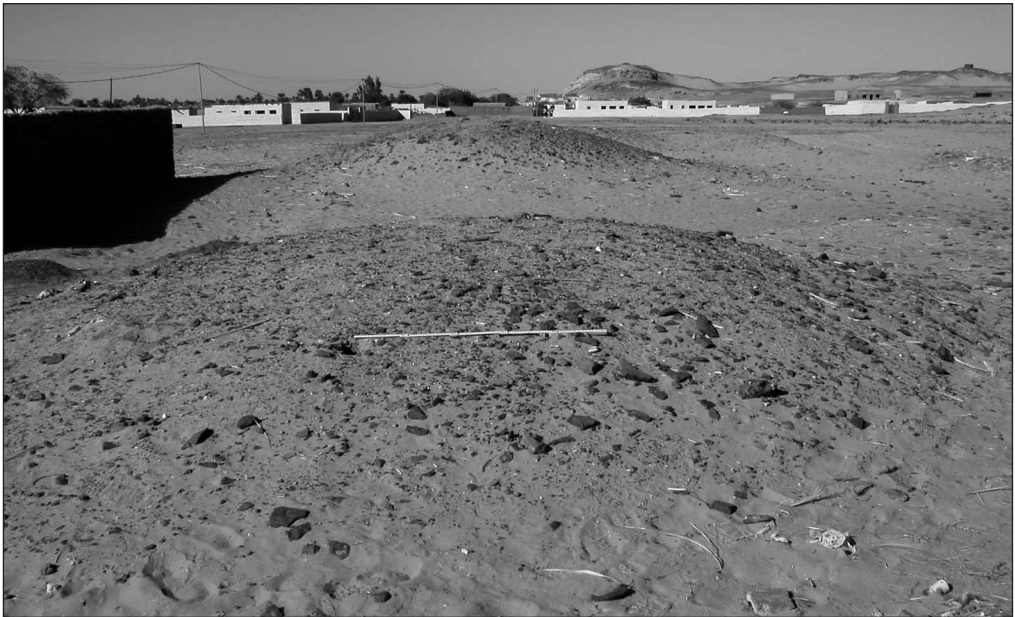
Fig. 2. View of the northern cemetery (Gh.2)

30 tombs, now the tomb count stands at a mere nine. North of the tumuli there is an extensive Christian and Muslim burial ground. The tumuli are small, round at the top, featuring a coat of relatively small stones. Their base area ranges from 37.5 to 104 m 2 ,