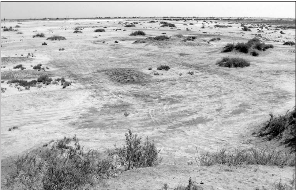
Fig. 3. Southeastern part of the prospected area, view from the south