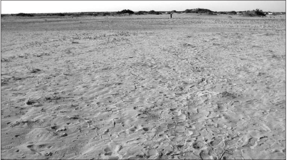
Fig. 2. Northern part of the prospected area, view from the north