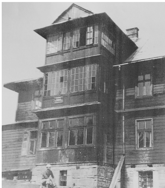
Fig. 3. Shelter “Makkabi” Kocierz Andrychów post-war years from 1945 to 1946