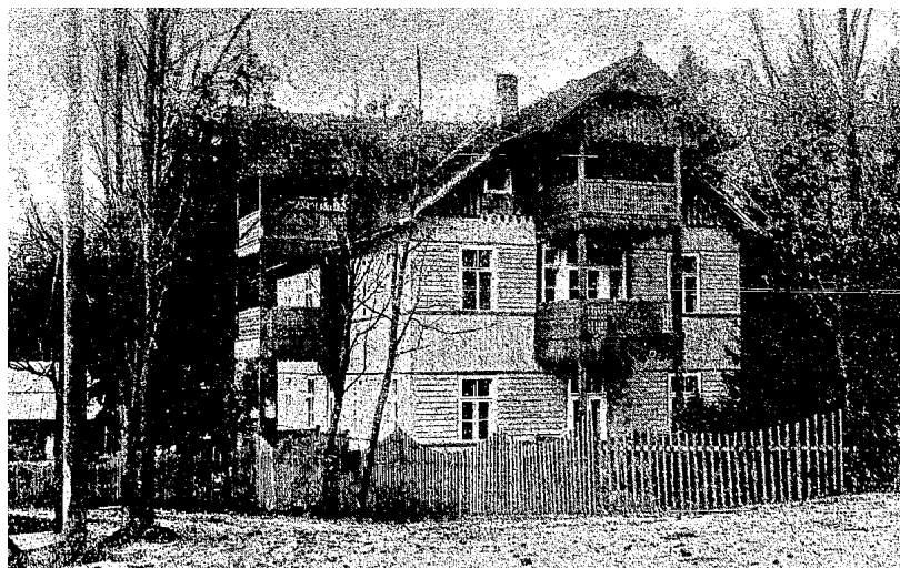
Fig. 2. ZTK Tourist House in Zakopane (Jaszczurówka) in 1930

Jałowiec. Specific preparation was in progress in agreement with PTT 11 . After several years of efforts, the idea of building their own shelters reached the next phase of implementation. In 1932, as a result of the efforts of “Makkabi” and I Bursa Crafts, the Shelter Building Committee was established under the Kowaniec in Nowy Targ. It was given the name of Dr. Edmund Schenker 12 . Initially, the amount of money paid by the members were modest and actually provided only for the purchase of land for the future shelter 13 . The Cracow Club organized a number of ski courses in Cracow, in Wola Justowska, where in February 1933 the board of the municipal park “Las Wolski” decided to allocate two rooms located there, “Domek Myśliwski” for the needs of skiers. Athletes could go and purchase hot meals at favorable prices 14 . In 1936, “Makkabi” announced the campaign of collecting resources to build their own shelters and reiterated its call for further financial support: “let us build our own shelter for Jewish skiers and tourists” 15 . In the same year, SN “Makkabi” Kraków has provided its members with discount accommodations and tourist stations supply: Milówka in Goldberger and Kalfus, in Zakopane “Wierchy”, in Rajcza, in Schächter, in Zawoja, in Fischer. In addition, all hostels Beskidenverein honored the Jewish SN's card 50% discount for skiers. However, Cracow “Makkabi” failed to build its own shelters until the outbreak of the war 16 .