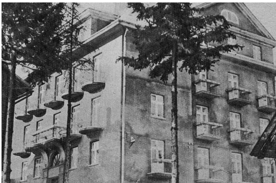
Fig. 4. Pension “Odaliska” in Krynica in 1929