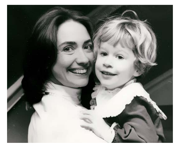
Fig. 2: Hillary and Chelsea Clinton https://www.hillaryclinton.com/about/bio/

The use of some black and white photographs in HRC's biographical site may be a useful device to bring the ethos of the origins to the foreground, and to indicate that her personal qualities are deeply rooted in traditional American values, possibly to counterbalance the image of an ultrafeminist promoted by some conservative media outlets. Apart from strictly private information, the bio-page features most highlights (photos, quotations) from her greatest public moments (including HRC's speech at the 1995 Beijing Conference on Women's rights, or her confirmation as a Senator). The website managers have taken good care that most of the overtly positive evaluations of HRC come from other figures (a strategy of endorsement) while the biographical narrative focuses on her motivations and actions. This device may be used effectively to present HRC as a modest, relatively self-effacing figure, whose achievements, nevertheless, should be widely acknowledged and appreciated.