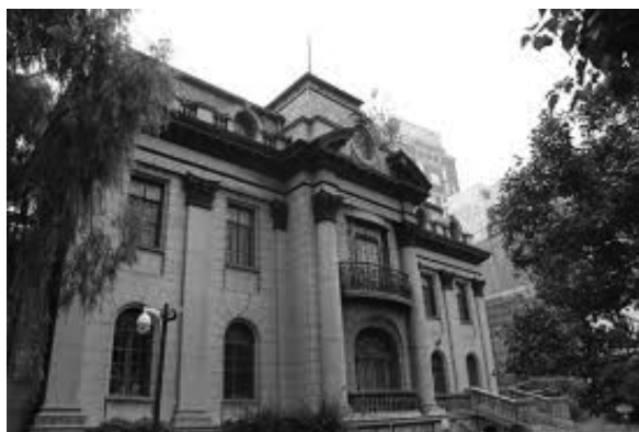
Fig. 4. Present-day view of the former residence belonging to Władysław Kowalski

played great organizational abilities, and was soon promoted to serve as a head of the Chinese Eastern Railway. At the same time, he sought capable wood suppliers for the rapidly expanding railway infrastructure in the Russian Far East 120 .