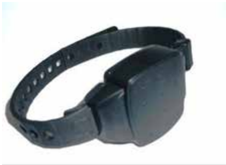
Figure 2 [Electronic Bracelet] 6

All technical means are owned by the state. Ministry of Justice of the Slovak Republic administrates them.