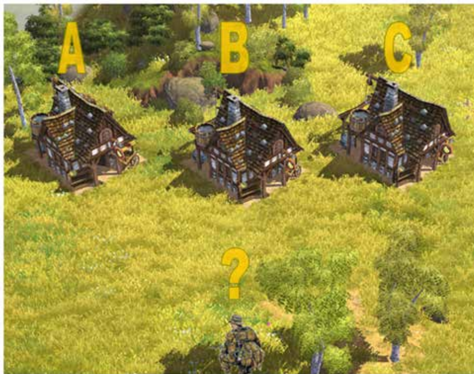
FIG. 1. THE MONTY HALL PARADOX

A few minutes before the planned attack on target (A), the leader unexpectedly receives information that it is certain that one of the other buildings (let us assume that it is building B) is empty. A question arises here: Should the leader storm building A, his first choice, or should he perhaps switch targets and storm building C?