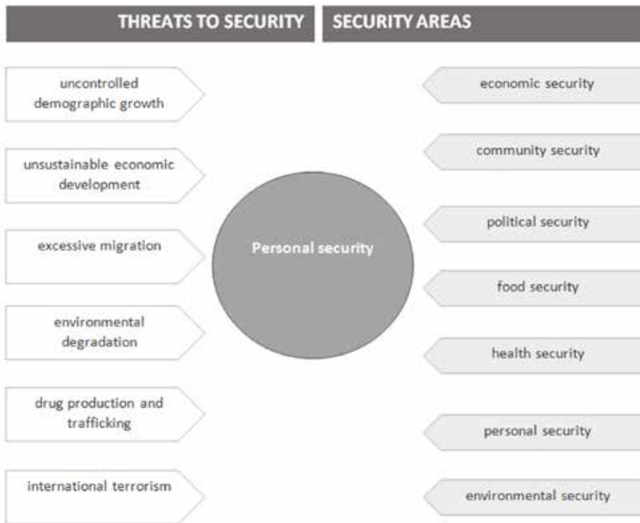
FIG. 1. AREAS OF PERSONAL SECURITY AND RELATED THREATS ACCORDING TO THE UNDP REPORT