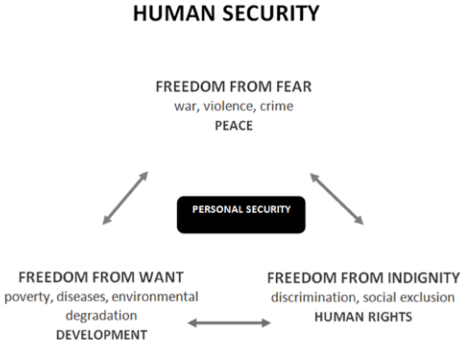
FIG. 2. A CONTEMPORARY APPROACH TO THE CONCEPT OF HUMAN SECURITY