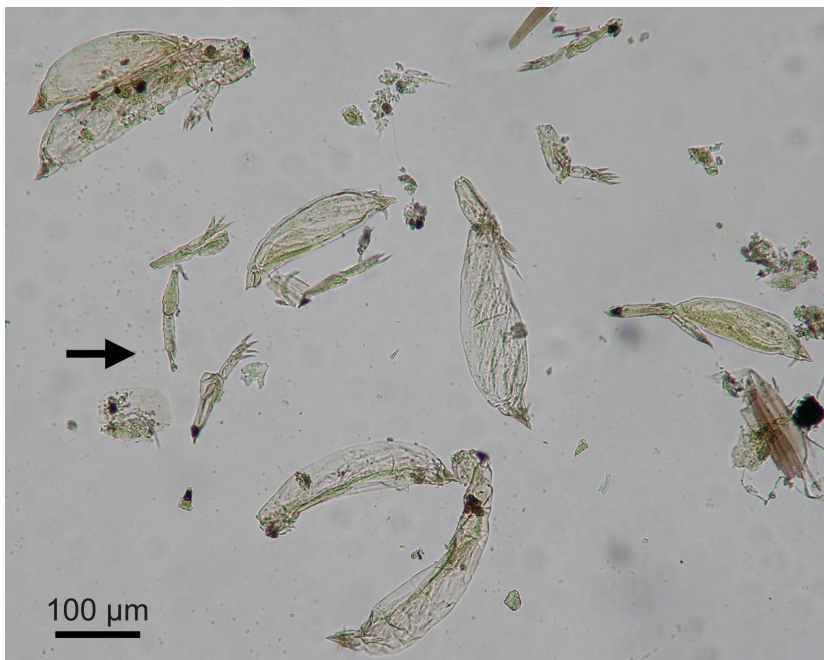
Fig. 1. Hesperomyces virescens thalli removed from the elytron of Harmonia axyridis from Divna. The arrow shows a group of thalli without perithecia.

The distribution of H. axyridis in Croatia, based on the records reported by Mičetić Stanković et al. (2011), Ivezić et al. (2011) and this paper, is shown in Fig. 2. Our records from Pelješac Peninsula are about 85-90 km SE of the town Sinj, the southernmost place in Croatia so far reported as a locality of H. axyridis (Mičetić Stanković et al. 2011).