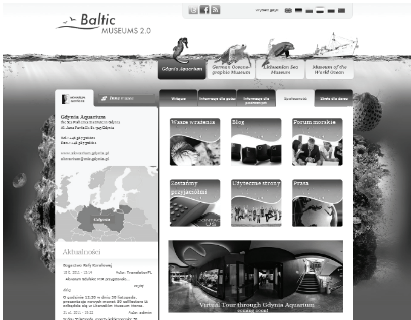
Figure 2. Main page of the Online Information Platform