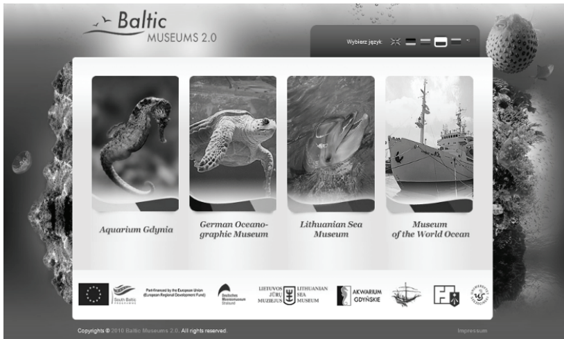
Figure 1. Entry page of the Online Information Platform