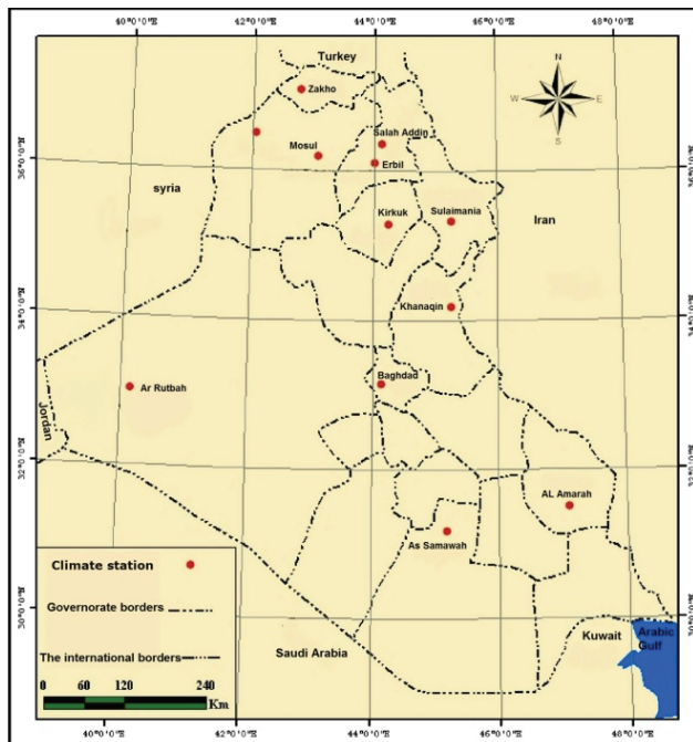
Figure 1. The spatial distribution of climate stations surveyed in Iraq