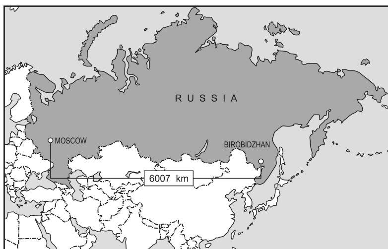
Fig. 1. Distance between Moscow and the JAR

anti-Semitism before and after World War II, destructions of libraries 4 , the fall of communism and Birobidzhan's continued, renewed existence and the revival of Jewish life in the post-Soviet JAR are not only a curious legacy of Soviet national policy, but after the break-up of the USSR and the religious worldwide rebirth, represent an interesting case-study in order to examine some geographic problems and interethnic relations.