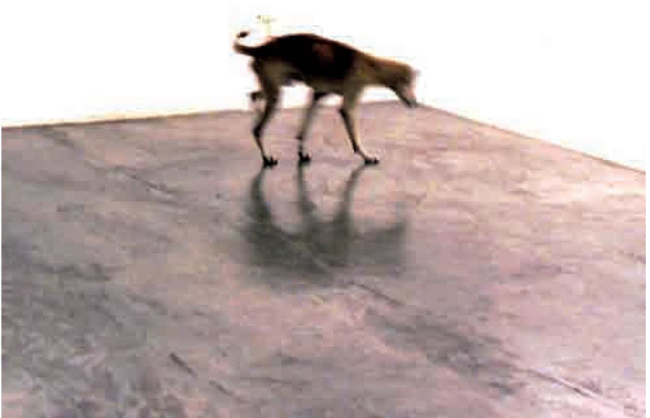
Habacuc Guillermo Vargas. Exposition #1 (detail dog), (2007).