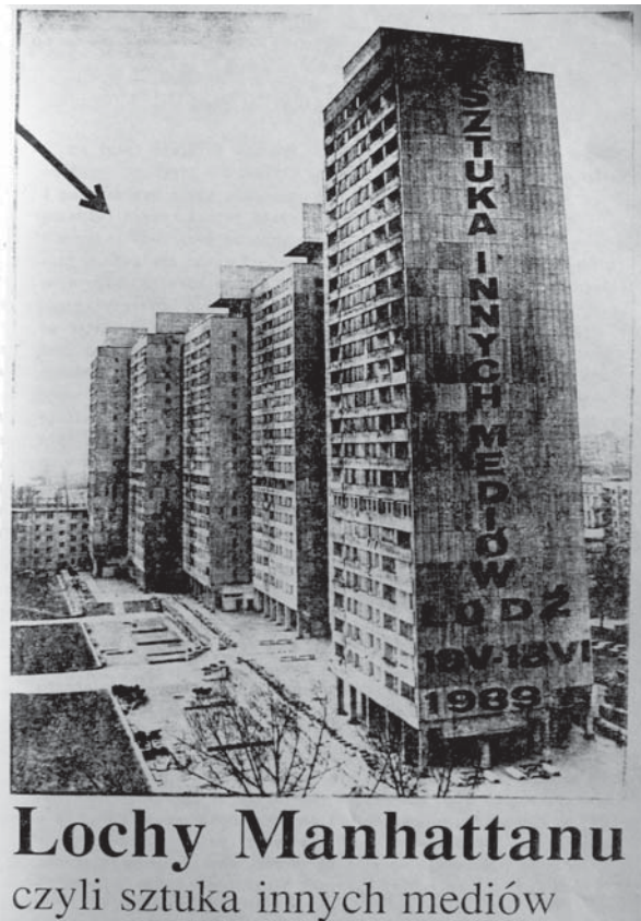
Lochy Manhattanu , 1989, exhibition preview invitation.