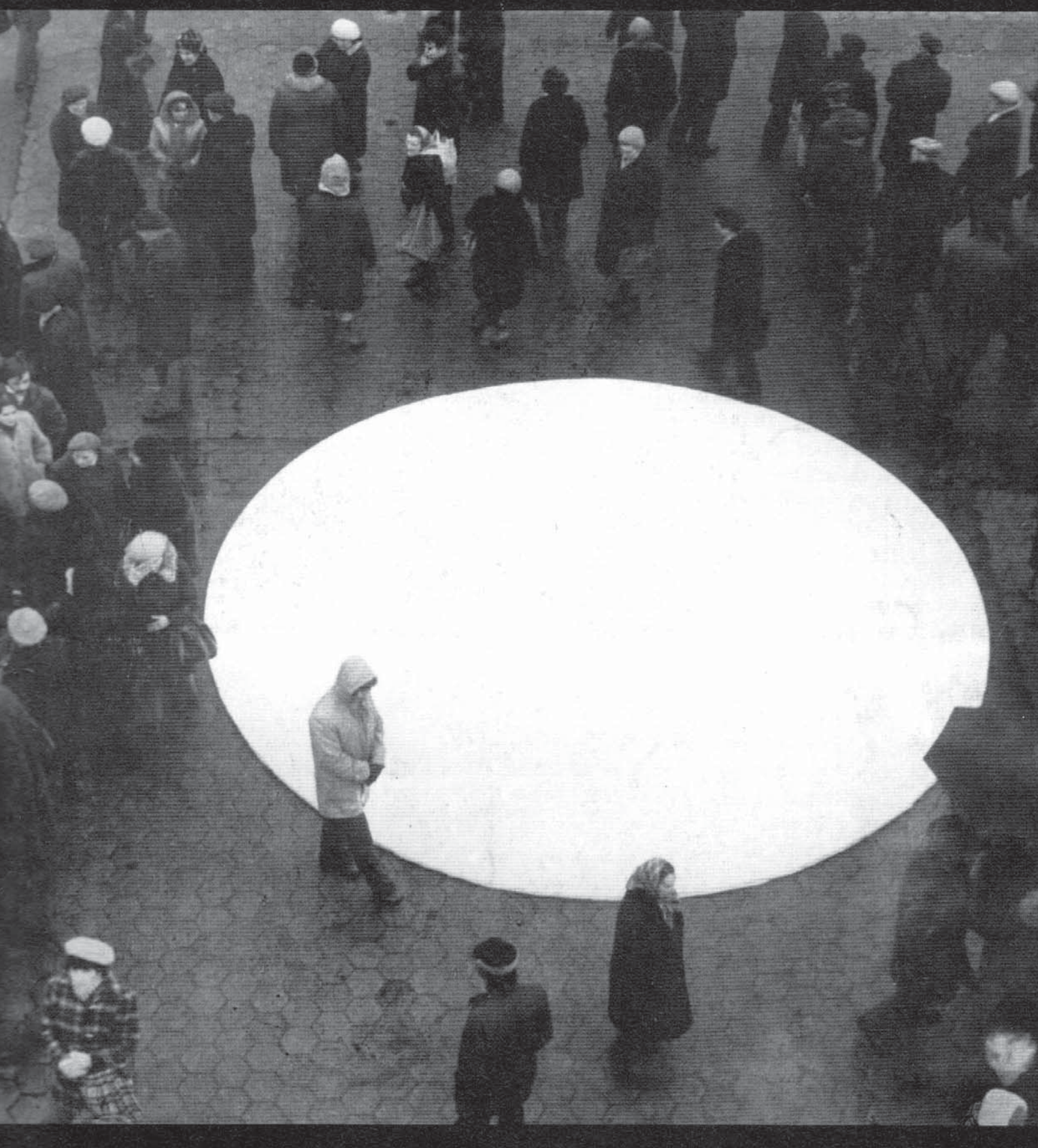
Construction in Process , still from Jozef Robakowski film, action by Sol LeWitt.