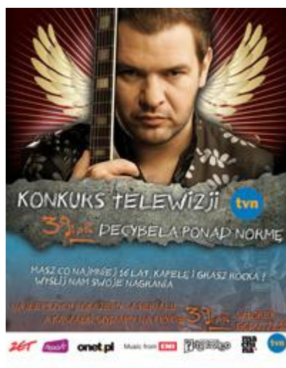
A poster promoting the contest 39 and a half decibels above the norm , Source: 39 i pół decybela ponad normę: ruszył II etap konkursu , http://muzyka.onet.pl/festiwal/9888,1942083,news.html , retrieved: 15. 05. 2009.