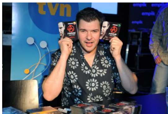
Tomasz Karolak after the koncert in Empik, Warsaw 12.03.2008