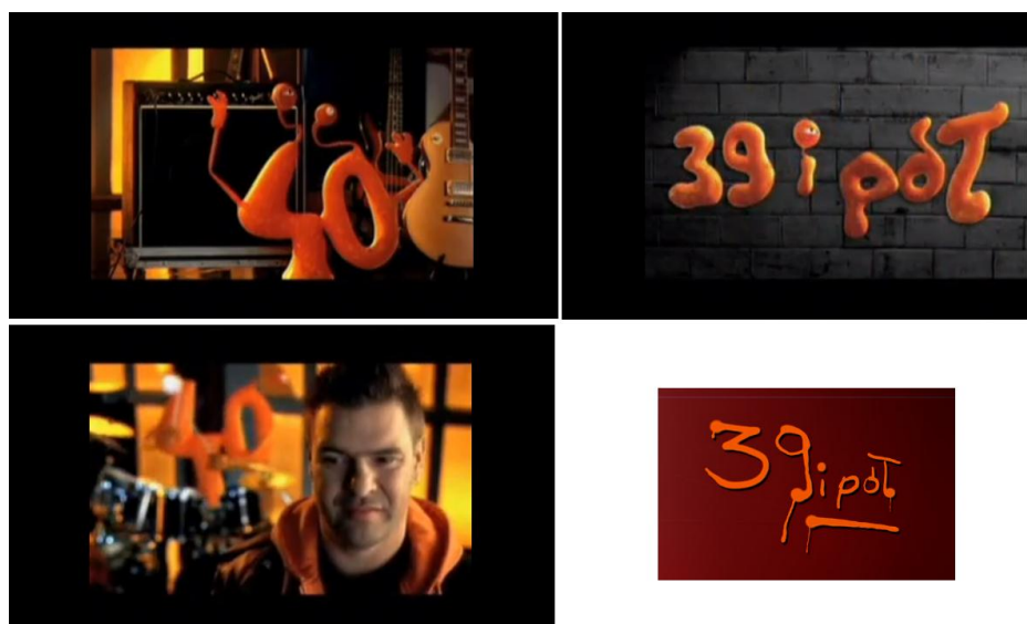
Clips from the first advertisement 39,50zł. Mobilny Internet Orange Free Bottom—right: 39 and a half official logo

Orange’s presence throughout the series, achieved using product placement, and its location on the show’s website as the official sponsor are used to strengthen brand identification with the television production. These identifications are created through using similar design (e.g., the hero image, a similar logo), and above all, using the theme of “escaping” from the number 40. By representing the show’s main character in these advertisements, his image has become stronger; in particular, his appearance, passion, and personality have been reinforced.