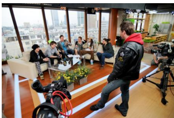
B-27 (the same line-up as Blog 27 ) visiting the Good Morning TVN show, Source: TV/Fabryka obrazu (Picture factory), Ostatni klaps na planie serialu "39 i pół" ,