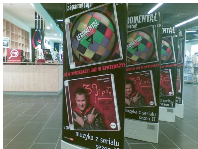
Advertising banner of the album released by Afromental and soundtrack of 39 and a half in Empik, Wrocław, Renoma Shopping Centre, 2009

The second season of 39 and a half focused on the band Afromental , which promoted its album during the broadcast using the series: the band gave concerts together with the Dirty Track (in the represented world and outside it), recorded video clips and met with fans. There was promotional feedback between 39 and a half and Afromental , evident in the actors of the series appearing in the video clip of Radio Song . They played characters that resemble characters in the series (e.g., the unhappy, effusive boss of a record company phonographic company and her submissive secretary; a couple of lovers; a provocatively dressed, attractive student). Enacted scenes in the video clip are based on the themes of the series (e.g., the band cannot live up to the record company boss's standards; the young couple is going through a crisis; the attractive black-haired woman charms the opposite sex) 14 . In the process, the video clip becomes a continuation, or rather a complementary, secondary, coherent with the series' narration. The band, situated in the centre of the video clip, is closely integrated into the represented world in which it is promoted for several months. These hybrid promotional activities were also reinforced by the joint promotion of the second season's soundtrack album and the album by Afromental Playing with Pop , which was available for sale in Empik stores, among others.