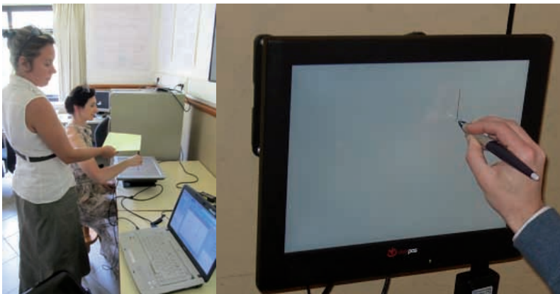
Fig. 1. The DP-TC test.

The main stimuli for representation are of two types: 1) lineograms (lines of 40 mm length) and 2) parallels (50 mm length with 8 mm of distance between them) (Figure 2). The participant should reproduce the stimuli as per indicated instructions first with visual guidance and without it (proper proprioceptive sensory test condition) by both hands. As per lineograms, they were represented in three movement types: transversal, sagittal and frontal; as per parallels, they were performed in the ascendant and descendent order. The more detailed description of method is provided in its manual (Tous et al., 2012), for lineograms you can see also (Tous, Muiños, Liutsko & Forero, 2012).