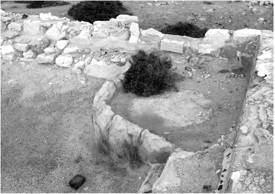
Fig. 2. Winery at Burg el-Arab, a close-up of the south-east corner of the treading platform, where the mechanical press ( stemphylourgikon organon , see section IV.2, p. 52) was located. The round, raised base marks the spot where the fruit pulp was placed. The screw was mounted over the base and passed through a wooden beam, the ends of which were fixed in walls of the corner. A low, thin wall separates the press area from the treading floor.

located in the NE corner of a large villa (figs. 1–2). A mechanical press was built on the treading platform and closed off from the surrounding area with a thin wall. The must from the mechanical press enclosure and from the treading floor flowed to the adjacent collection vat through two separate channels. The winery at Taher el-Masry 10 (N 30° 56.594', E 029° 34.582')