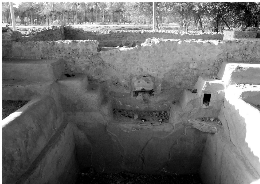
Fig. 7. Winery at Marea, view of the northern face of the wall which separates the treading floor ( lénos ) in the upper part of the winery from the vat ( pitbos ) located in the lower part. In the centre one can see the damaged lion-head spout of the main channel leading from the lénos . To the right is an opening of the channel from the mechanical press area. In the foreground there is the southern wall of the collection basin. The ledges on the eastern and western walls most probably served for mounting a cover on the basin.

a complex of five treading floors with four mechanical presses. It was built of mud brick and stone blocks covered with waterproof plaster. Another winery was found behind the apse of the basilica 17 (N 30° 50.458' E 029° 39.823'). It consisted of two rooms, the first housing one large treading platform flanked by two mechanical presses, a collection vat, and one smaller, raised platform. In the second room there was another treading floor and vat. The third winery 18 within the area of Abu Mina was