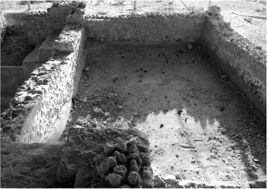
Fig. 6. Winery at Marea, view of the lênos from the south-west. The floor is covered with waterproof plaster and gently slopes towards the opening of a channel, which leads under the low wall (left) and to the vat. The walls of the winery are built of small cobbles bound with lime mortar.

Hassan Bey. It consists of two complexes of two treading floors feeding into one vat. 15