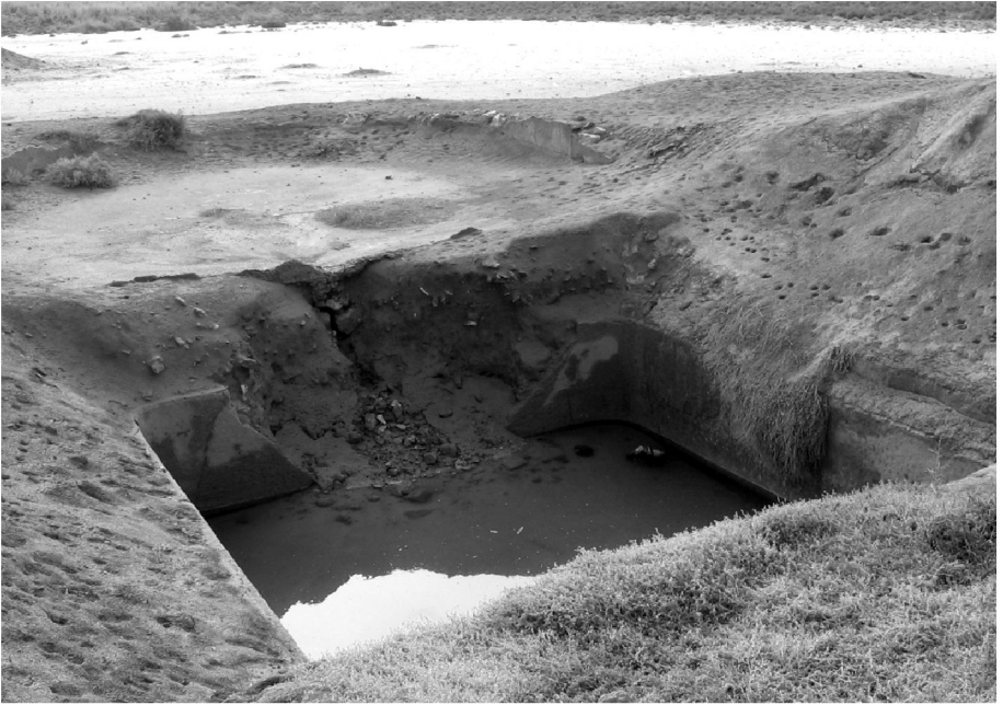
Fig. 9. One of the press units of Karm el-Baraasi, located west of the published unit. A semicircular treading platform and a vat, now filled with water. Rising ground water is a serious threat to the wineries around Abu Mina. The mud brick walls are dissolving and only crumbling layers of waterproof plaster remain.

6th cent. AD) partly on top of the old one. This new structure comprised a treading platform, a vat, and two mechanical presses. In both phases of use, the winery stood next to a multi-story country house. The winery at Karm Gadoura 20 consisted of two treading platforms, two vats, one mechanical press, and storage rooms. The structure was built of mud brick and re-used stone blocks. The winery at Karm el-Shewelhy (N 30° 49.377' E 029° 38.650') consisted of a treading platform and vat, two storage rooms, and a courtyard. The wine-making unit was hewn in rock except for the eastern wall, which was built of limestone blocks. The