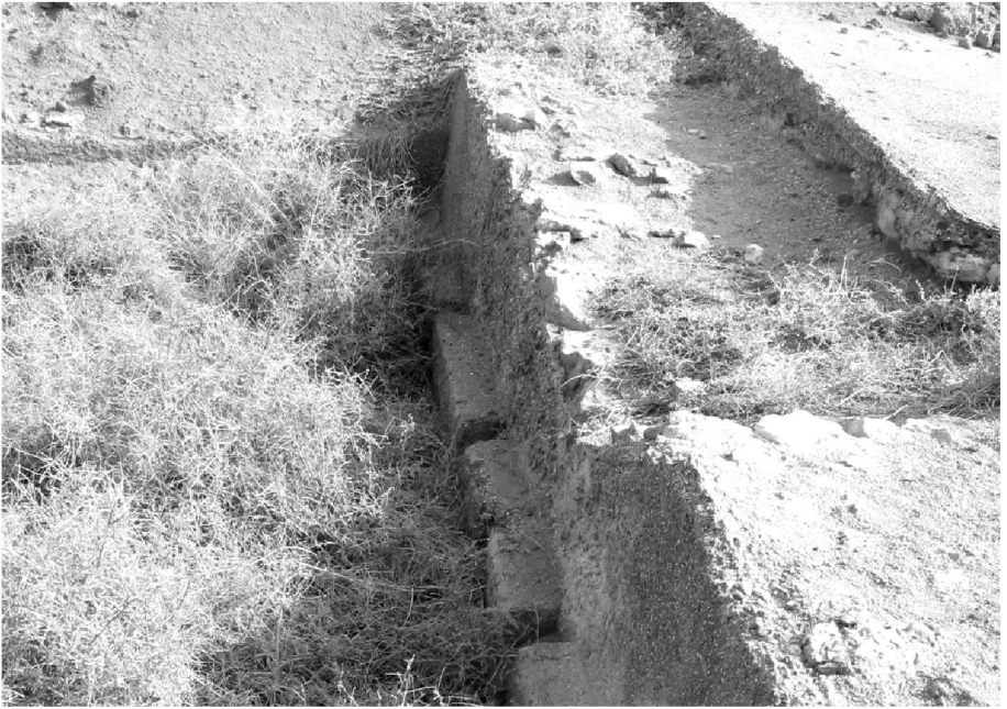
Fig. 8. Winery at Karm el-Baraasi near Abu Mina, close-up of the southern edge of the pithos (backfilled, left) with four notches, probably used for mounting a wooden lid.

uncovered in the so-called 'Kumring A', in three rooms of building 17, entered from a courtyard. Two of these rooms contained a set of one large and one small treading platform and vat. The third room on the opposite side of the courtyard was used for storage.