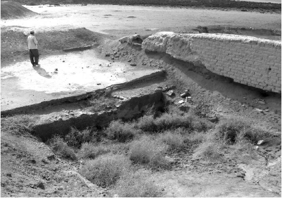
Fig. 10. The published, eastern press unit in Karm el-Baraasi. In the foreground the outline of a large, backfilled basin is visible. Further to the left is a rectangular treading platform laid with waterproof plaster. The western wall of this structure still stands, although the mud bricks are badly damaged by water.

floor of the treading platform and the walls of the vat were covered with waterproof plaster. Another sizeable winery at Karm el-Baraasi (N 30° 50.414' E 029° 40.495') consisted of several large treading platforms with vats and mechanical presses (figs. 8–10 and sketch in fig. 11). 21 The complex was built of mud brick with corners reinforced with limestone blocks. The entrance to the unit uncovered by the excavators led from a