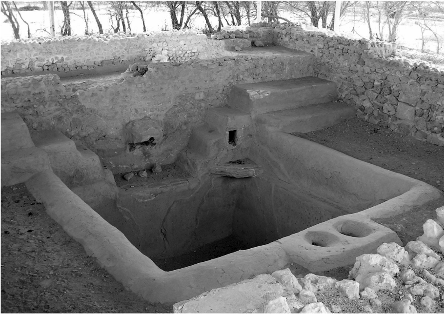
Fig. 4. Winery at Marea, view from the north-east. In the front – the pithos , lined with waterproof plaster. Two flights of steps lead to the other side of a low wall, behind which the lénos is located (visible in the background). The must from the treading floor flowed out into the pithos through a channel ending with a damaged, lion-head spout (centre of wall). To the right of the lion head is the opening of a channel leading from the mechanical press area.

E O29° 40.129') consisted of a large treading platform, a smaller room with a base for a mechanical press, and a collection vat (figs. 4–7). Two separate channels led from the two rooms to the vat. The rooms where the pressing took place were raised higher than the room of the vat and two flights of steps connected the two levels. An unexplored winery in southern Huwariya, 12 built of irregular stone blocks, clay and waterproof plaster, consisted of one press unit – a treading platform and vat connected by two flights of steps. The round base of a mechanical press was set in a niche in the wall of the treading platform. A channel in the floor of the