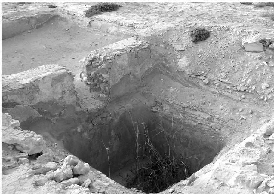
Fig. 3. A small winery at Taher el-Masry near lake Mareotis. Both the treading platform ( lênos – see section IV.1, p. 43) and the vat ( pithos see section IV.3, p. 61) are visible. The destroyed section of the low wall separating the two parts marks the place where a stone, lion-head spout was once located. The structure is built of small cobbles bound with lime mortar and lined with waterproof plaster. There are traces of unexcavated structures surrounding the winery, suggesting that it might have functioned in a broader context.

was built of stone blocks and stone rubble embedded in cement (fig. 3). The uncovered press unit consisted of a square treading platform (3.75 m x 3.75 m) and a vat (2.37 m x 2.00 m), 1.40 m deep. Outlines of structures surrounding the unit suggest that the winery may have been part of some kind of a larger complex. A restored wine-making unit near Marea 11 (N 30° 58.491'