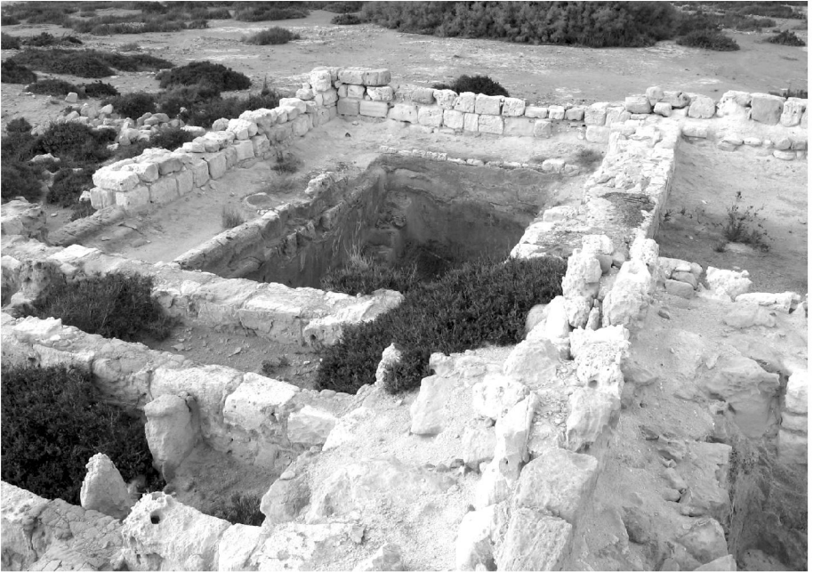
Fig. 1. Winery at Burg el-Arab, view from the south-east. The winery occupies a corner of a larger building and was probably a part of an industrial complex together with a nearby pottery kiln and other facilities. The walls of the structure were built of limestone blocks. The lower part of the winery, occupied by a large, deep vat (centre) covered with waterproof plaster, is separated by a low wall from the raised treading platform (right).

waterproof plaster was raised 30 cm above the floor level of the building. Two channels led through a wall separating the platform from a collection vat, measuring 1.60 m in depth, 4.20 m long and 2.20 m wide. Twin flights of steps connected the two parts of the winery.