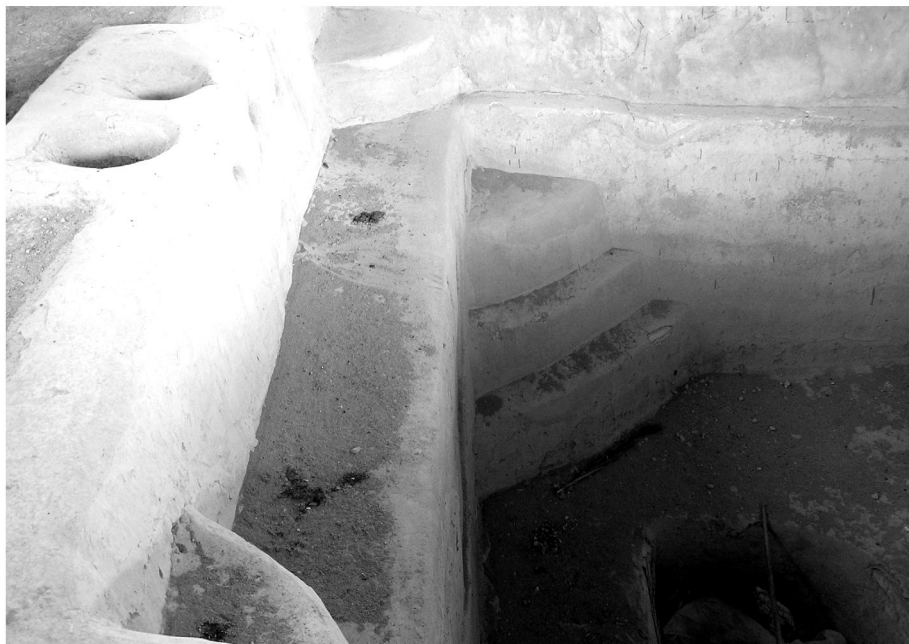
Fig. 5. Winery at Marea, a close-up of the pithos , view from the south. Three steps descend to the bottom of the collection basin. Visible at the bottom is a concavity in the floor of the basin. On the northern edge of the vat there are two round indentations with funnels leading back to the basin.

platform led from the press directly to the vat. The installation 3 km south-east of Huwariya 13 consisted of a treading platform, a vat and a mechanical press separated from the treading floor by a low, thin wall. A channel under the floor led from the mechanical press to the vat. The walls of the structure were built of irregular stone blocks bonded with mortar and covered with plaster reinforced with potsherds. The winery at Kom Truga 14 south of Alexandria was built of stone blocks. It consisted of a treading platform and a vat. Of the coastal wineries, the one located farthest to the west is the structure excavated by an Egyptian team in