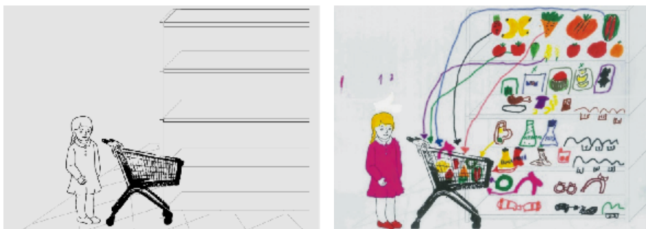
Fig. 1. The example of the unfinished thematic drawing “The child in the shop”, given to children, (on the left) and the finished drawing (on the right).

Rys. 1. Przykład niedokończonego rysunku pt. „Dziecko w sklepie” rozdane dzieciom (po lewej) i dokończony rysunek (po prawej).